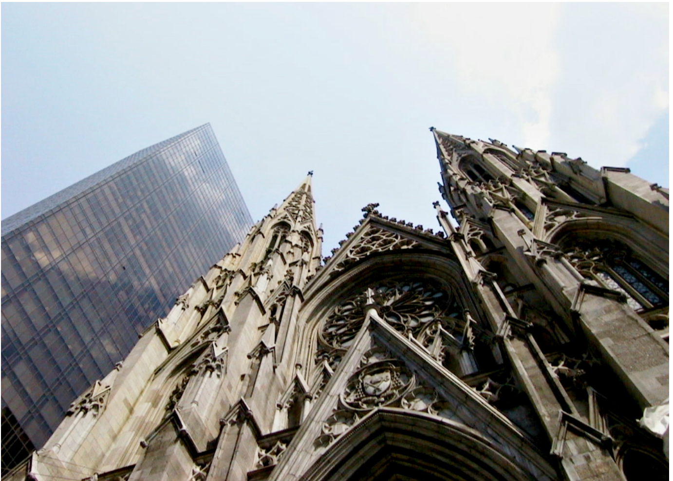
St. Patrick's Cathedral in Manhattan, New York

A Catholic parish in El Paso, Texas, continues its summer bazaar this year. However, there will be no more carnival rides , as the parish responds to the tragic death of a teenager at last year's event.