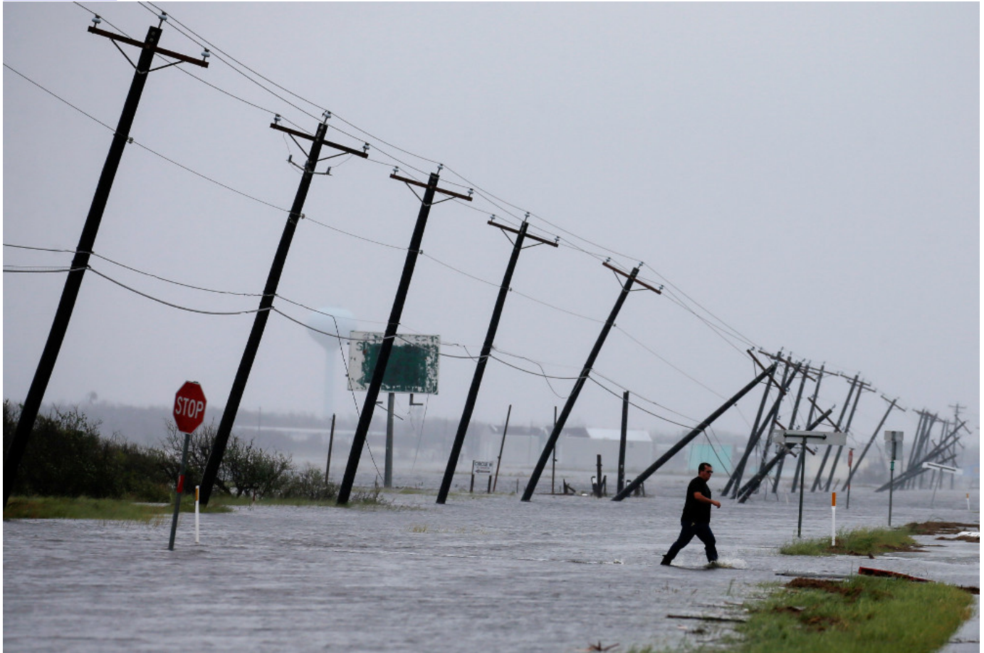
A man walks through floods waters and onto the main road Aug. 26 after surveying his property which was hit by Hurricane Harvey in Rockport, Texas.