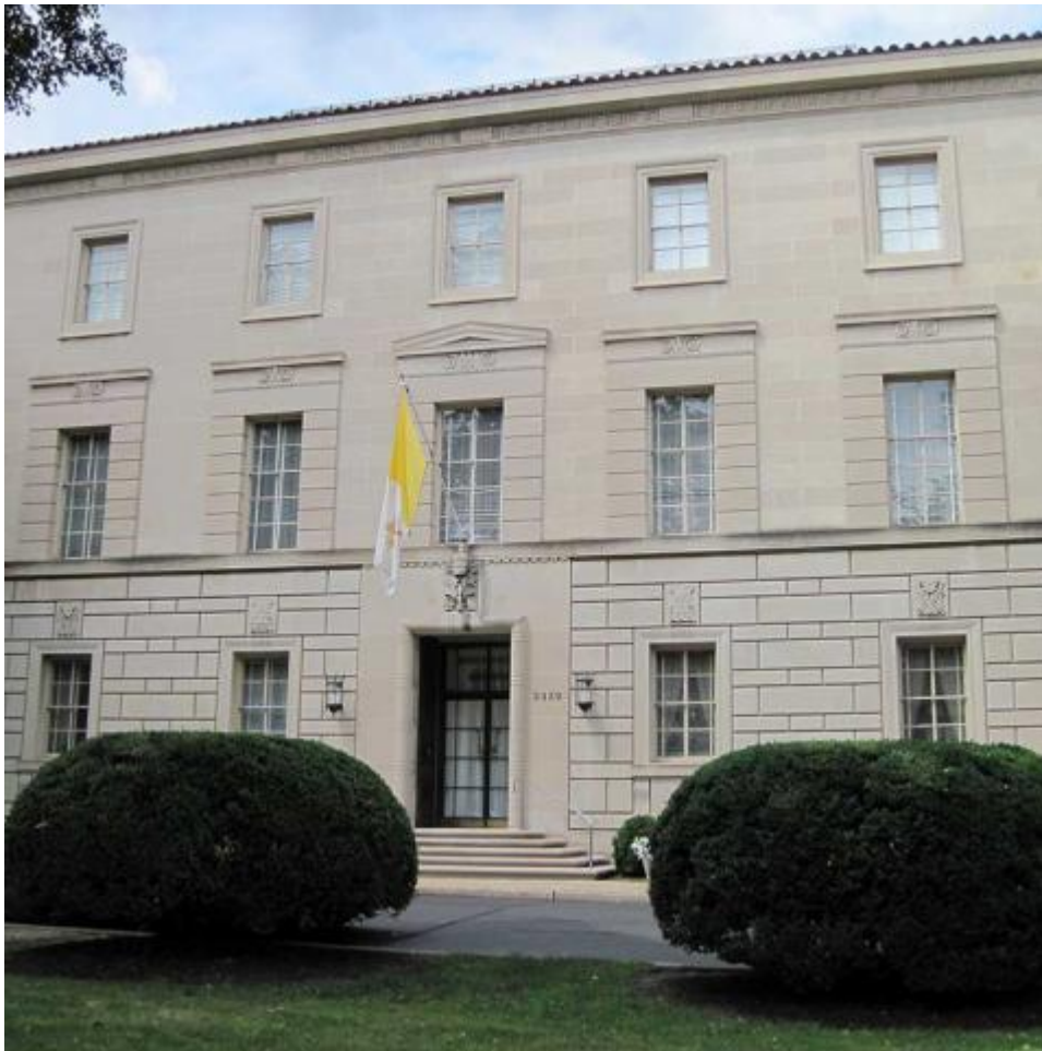
Apostolic nunciature in Washington, D.C.

This is certainly progress from the days when reporters would have only gotten a "no comment" from the Vatican. But, for the most part, the Vatican is making a mess of it. The Vatican followed the old, failed strategy of saying as little as possible rather than getting all of the story out at one time. Today, professional PR firms recommend getting all of the bad news out as soon as possible in order to limit the number of follow-up stories.