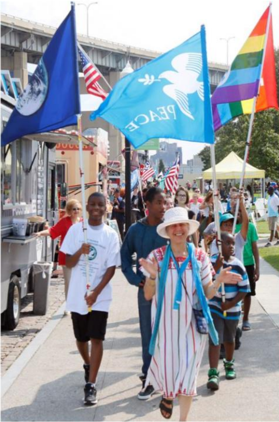
Campaign Nonviolence in Buffalo, New York, 2017

LONDON, ENGLAND — Faith-based groups, including Catholic peace group Pax Christi, the Anglican Peace Fellowship, nearly 200 British Quakers and Wake Up London, a Thich Nhat Hanh-inspired mindfulness group, joined thousands in protesting the world's largest arms fair, the Defense and Security Equipment