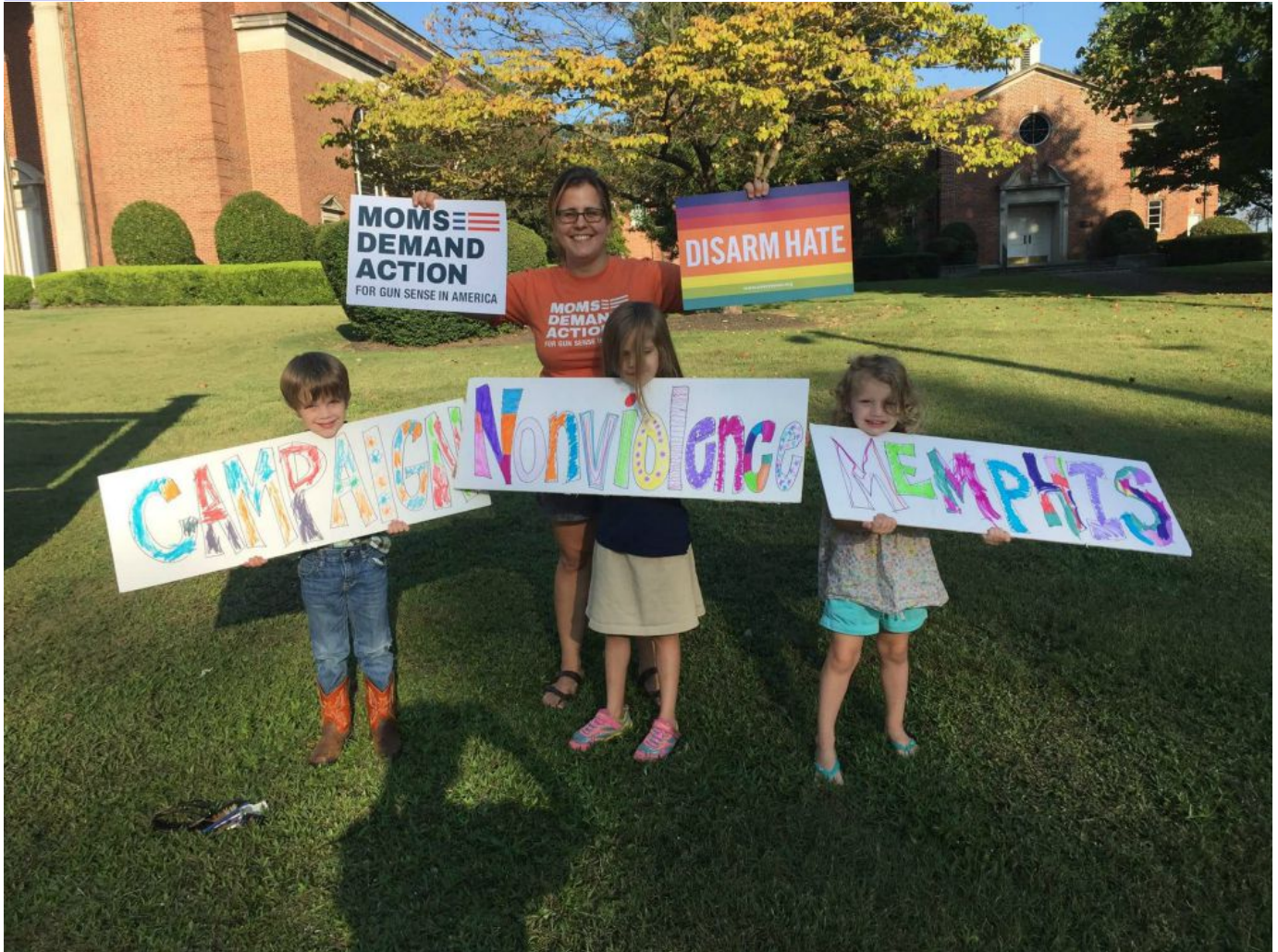
Campaign Nonviolence witness action in Memphis, Tennessee, part of Pace e Bene's 2017 campaign for the International Day of Peace