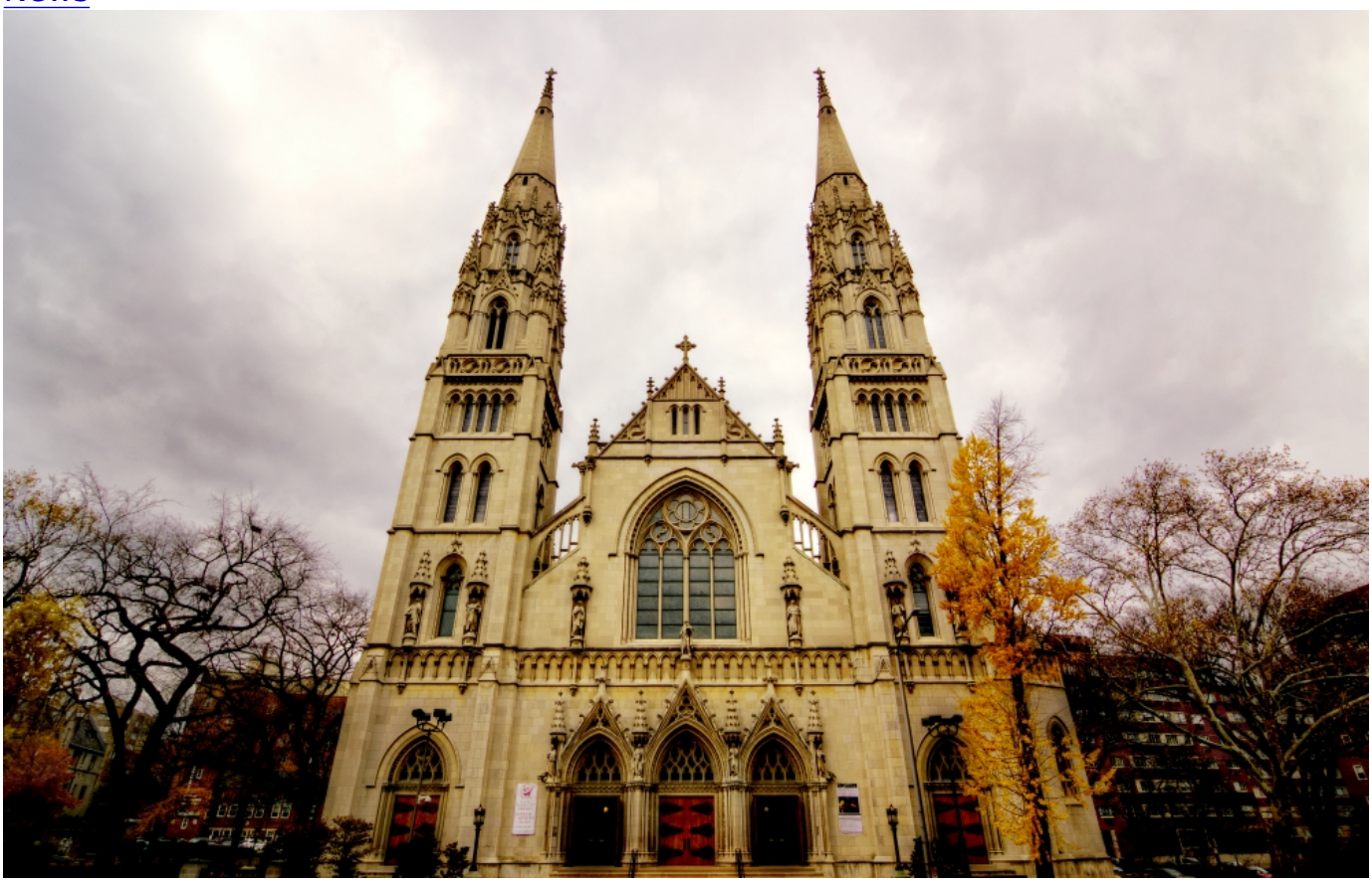
St. Paul Cathedral in Pittsburgh