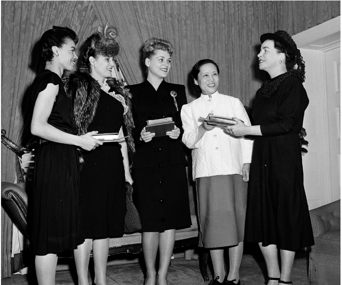
Pauli Murray, left, then a New York lawyer, receives a Mademoiselle Merit award Dec. 30, 1946, as one of 10 young women selected by Mademoiselle magazine as "Young Women of the Year."