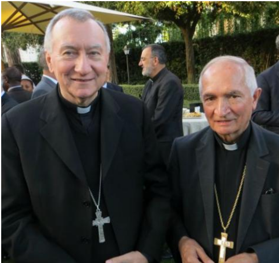
Cardinal Pietro Parolin, left, with Archbishop Silvano Tomasi at a U.S. embassy to the Holy See event Sept. 22

"We are aware of the invaluable experiences he has gained over the years," she said. "We are aware of his ability to master the art of diplomacy and his deep sense for politics."