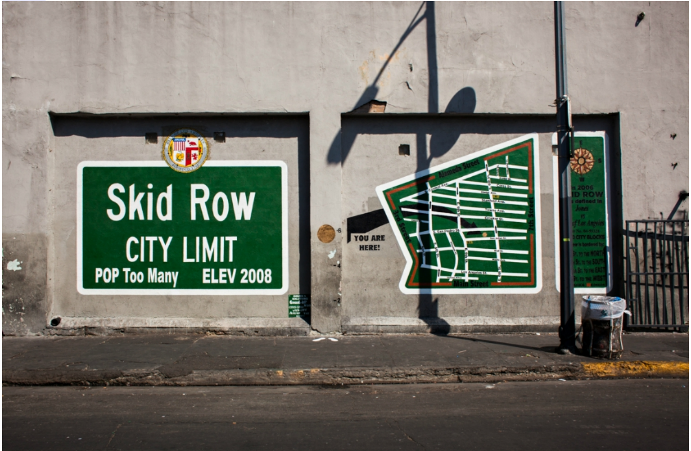
A mural located on San Julian Street in the heart of downtown Los Angeles' skid row