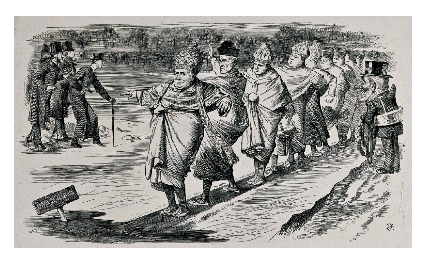
An 1869 English illustration satirizes the debate over papal infallibility during the First Vatican Council.

Cardinal Henry Manning of Westminster, England, and W.G. Ward of the Dublin Review were the two most prominent advocates of this "galloping infallibility" in the English-speaking world. But other Catholics, and many governments, feared the effect of declaring the syllabus, with its condemnation of modern democratic norms such as religious freedom, infallible.