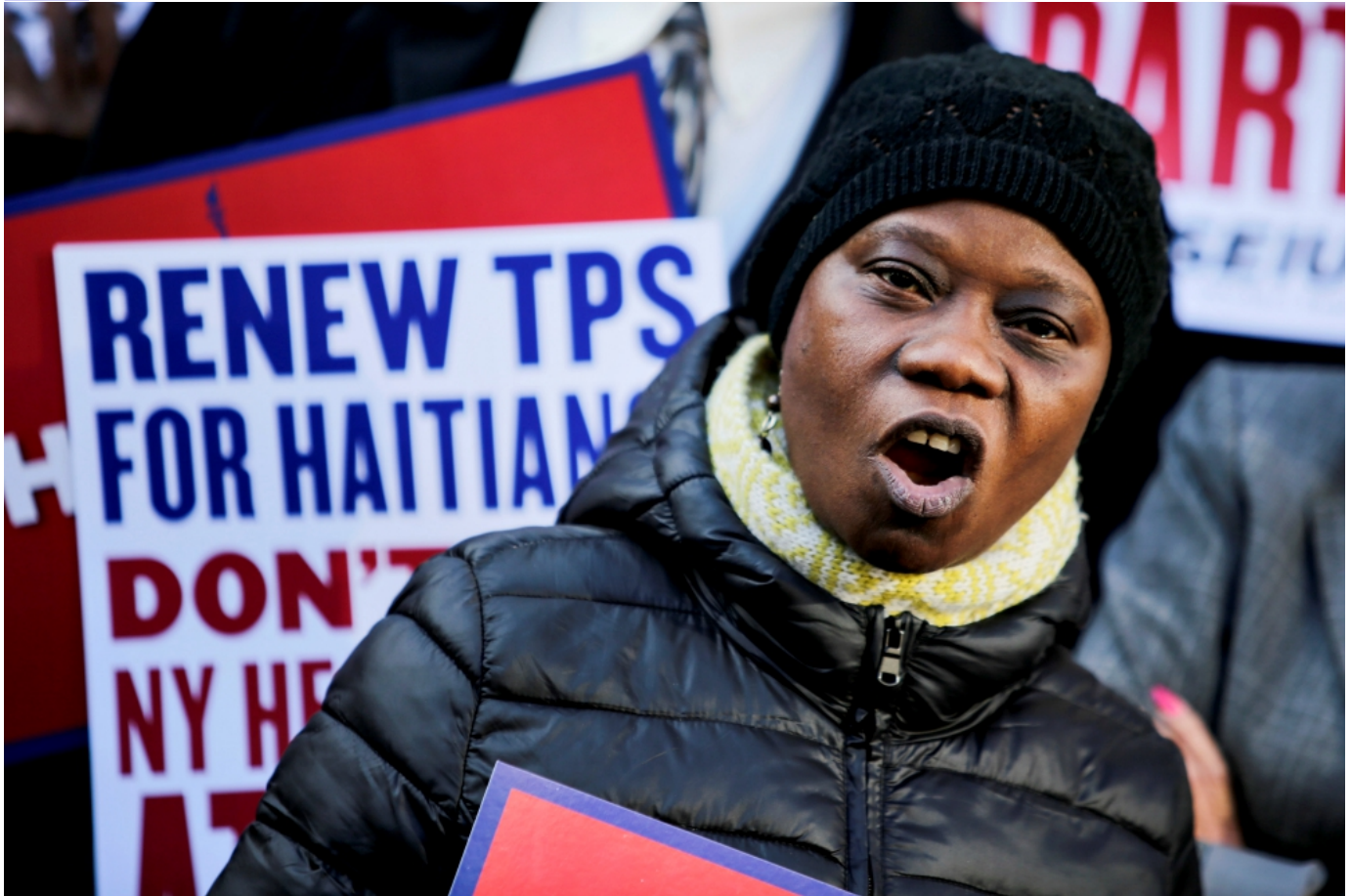
A woman participates in an immigration rally for Haitians Nov. 21 in New York City.