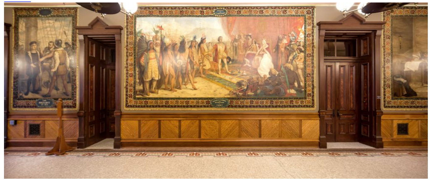
Image some of the 12 murals painted by Luigi Gregori between 1882-84 in the Main Building of Notre Dame University.