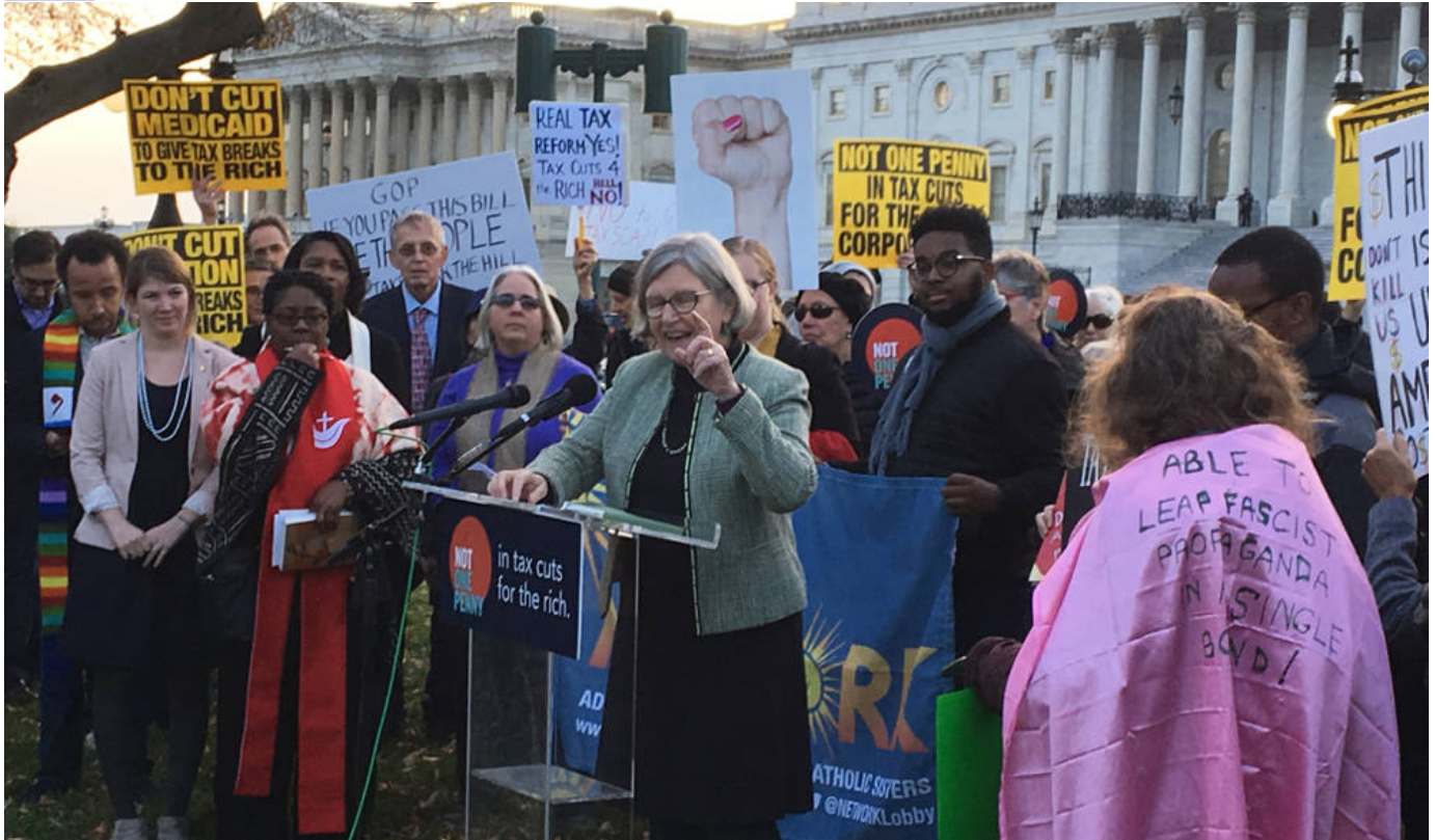
Sister of Social Service Simone Campbell leads a rally rejecting the GOP tax plan outside the Capitol Nov. 30.