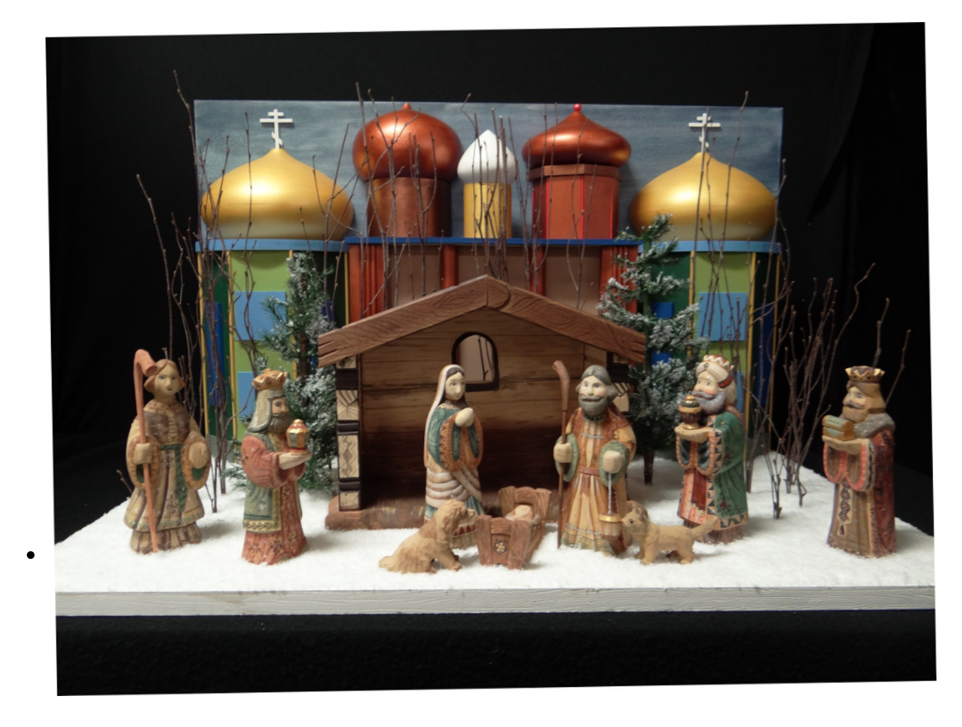
A nativity scene by Russian Artists' Cooperative