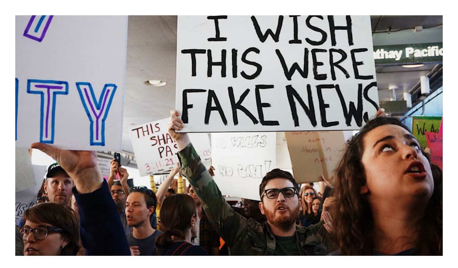
Photo taken at a protest against President Donald Trump's travel ban, at Los Angeles International Airport