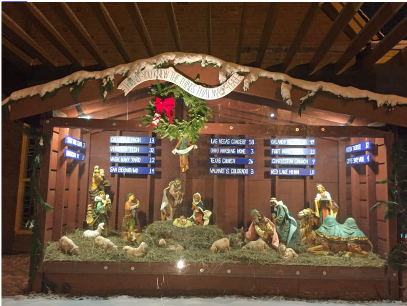
St. Susanna Parish's Nativity scene