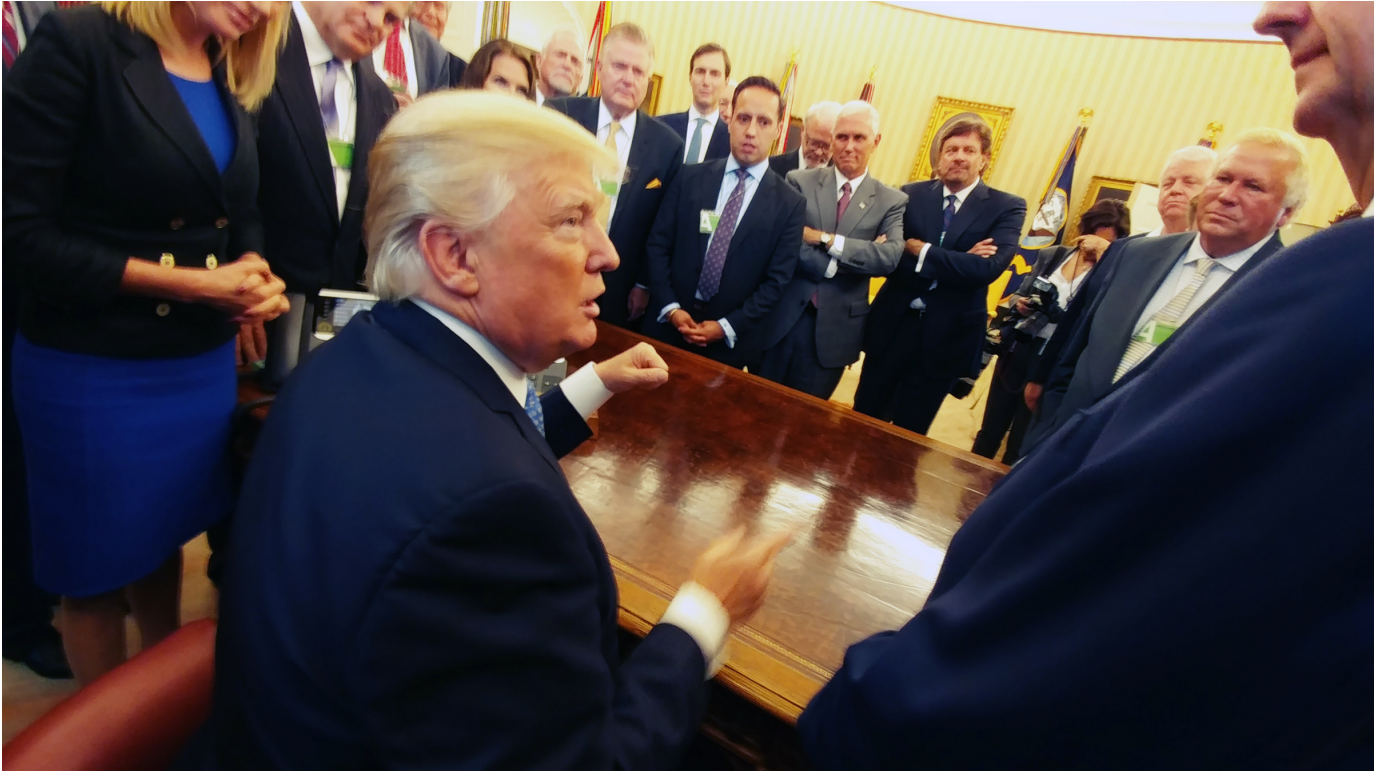
President Trump meets with faith leaders inside the Oval Office on July 10, 2017.

2018 will likely see white evangelical Protestants remaining locked in for Republican candidates in the midterm elections. According to the exit polls, 81 percent of white evangelical Protestant voters pulled the lever for Donald Trump in the 2016 presidential election, and they strongly supported the president throughout his first year in office.