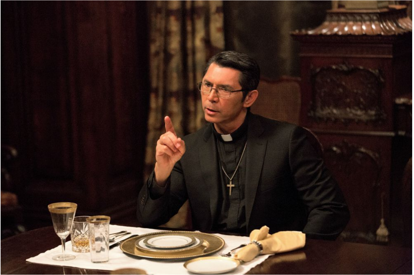
Lou Diamond Phillips

Although the film's production occurred before the start of the #MeToo and #TimesUp movement, the cast is happy to contribute to the larger discussion.