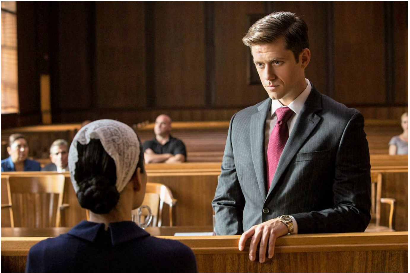
Edy Ganem, left, as Alejandra Batista, with Aaron Tveit as Tommy Reilly in "Created Equal" (Vision Films)