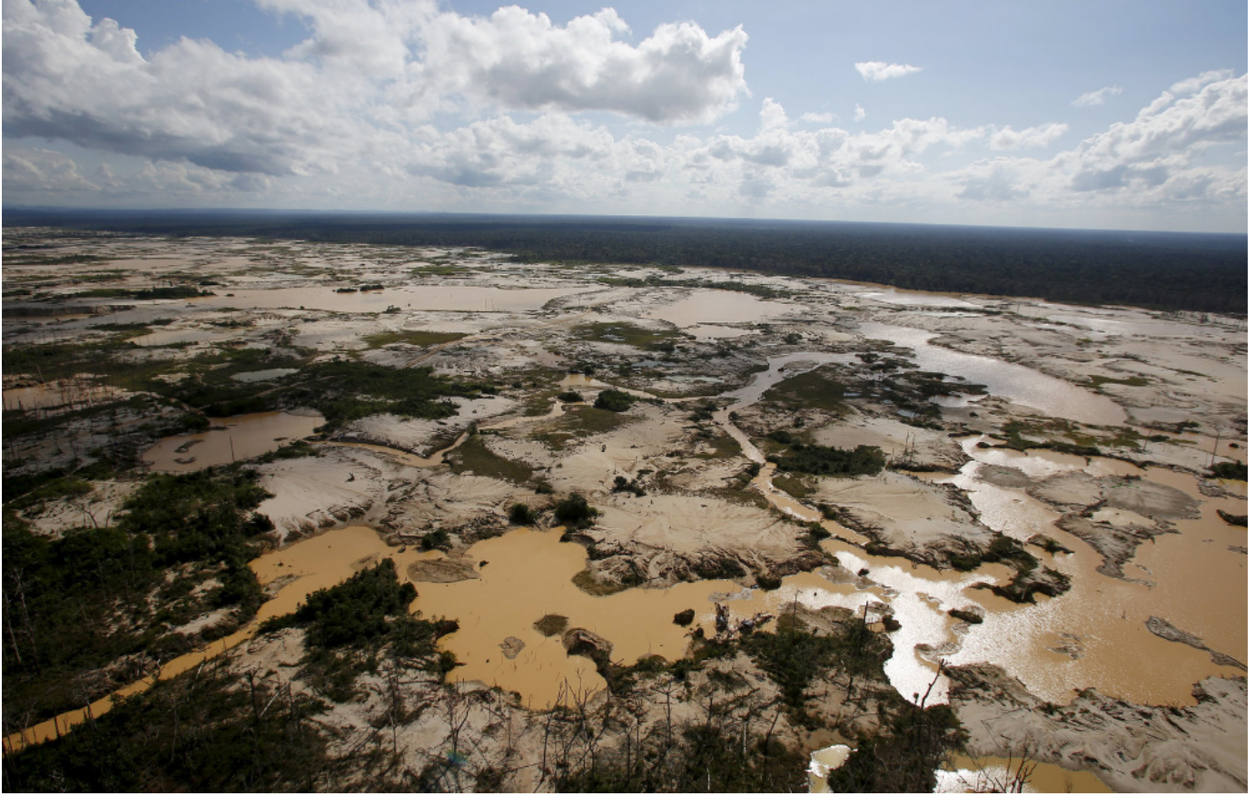
An area deforested by illegal gold mining is seen in a zone known as Mega 14, in the southern Amazon region of Madre de Dios, Peru.