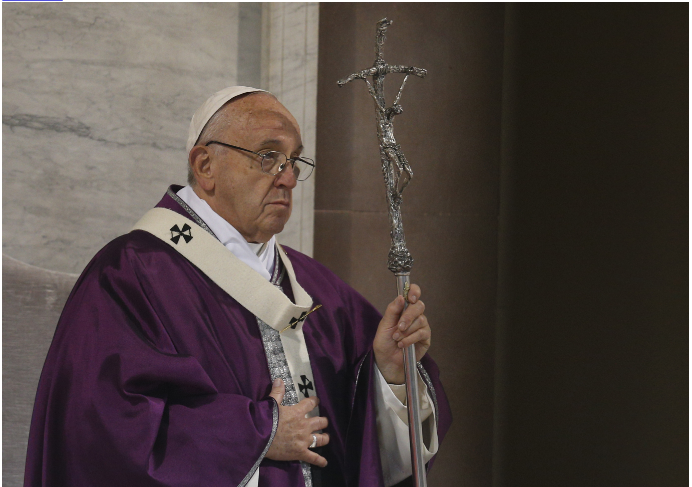
Pope Francis holds his crosier during Ash Wednesday Mass at the Basilica of Santa Sabina in Rome Feb. 14.