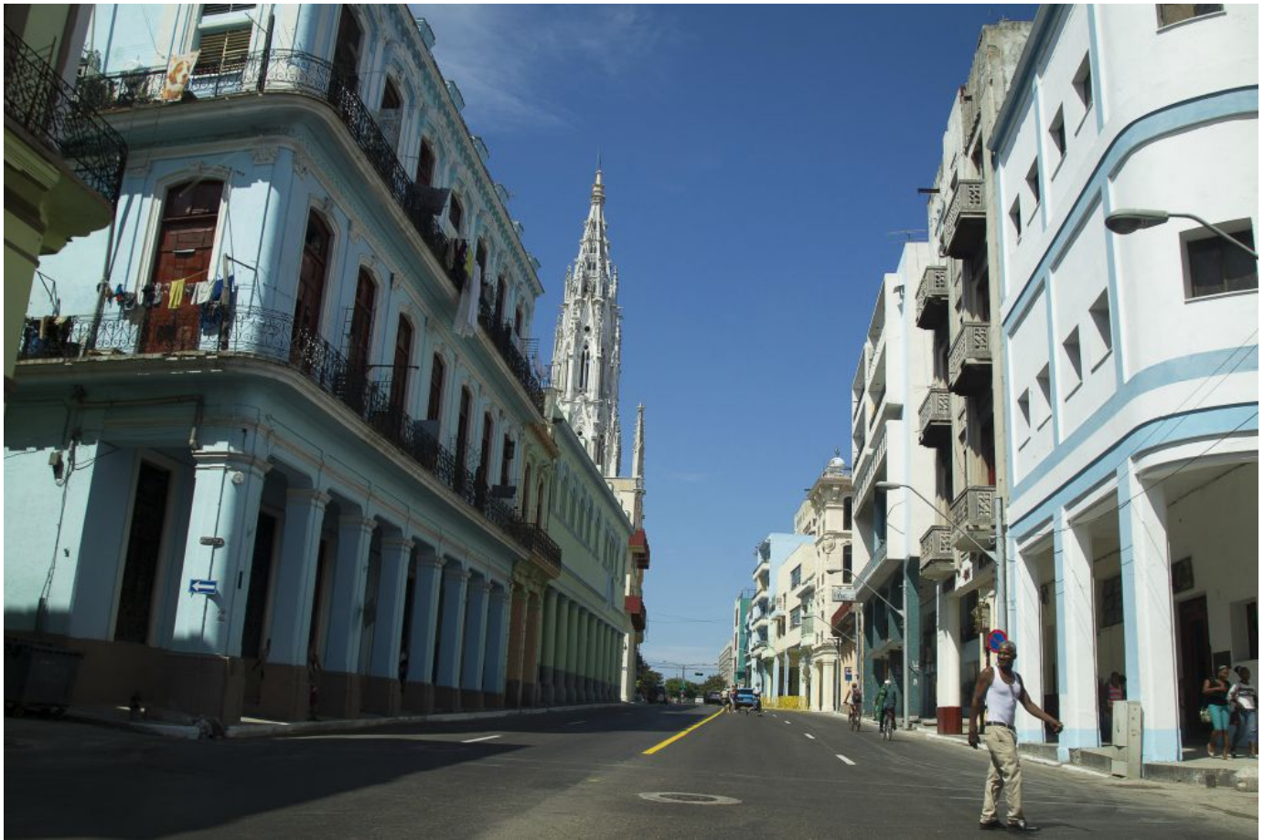
A man walks near the Church of the Sacred Heart of Jesus in Havana Sept. 19, 2015.

Many seemed shocked by the evident poverty and shortages faced by most Cubans. "Nobody lives on $30 per month," noted our guides, referring to the government's official average monthly wage. They were quick to point to a quasi-"underground" economy in which even doctors and university professors supplement their wages as tour guides, baristas, maids and drivers. Several home owners offer hospitality to tourists, a Cuban version of the Airbnb business model. Coveted construction jobs are plentiful, too.