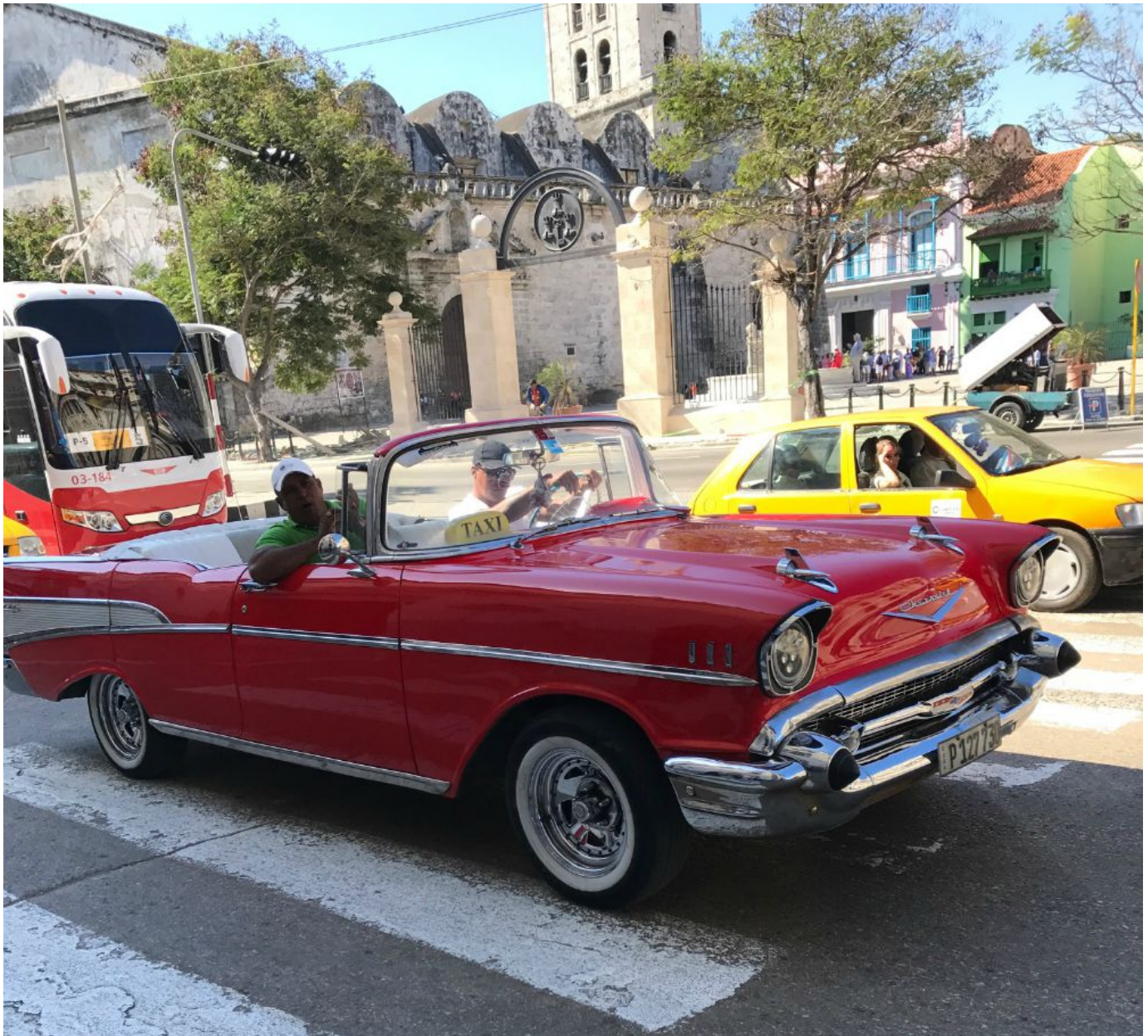
Cuban taxi

While the Educational Opportunities group was visiting, a new church opened in Sandino, Cuba, the first in 60 years, funded by a parish in Tampa, Florida. The Catholic Church is also holding leadership classes, offering a moral framework for several of the estimated half-million start-up firms that constitute a quarter of the Cuban economy and a third of its workforce.