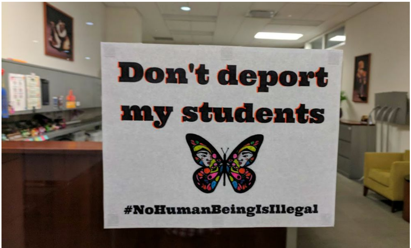
A poster at the library at Loyola Marymount University