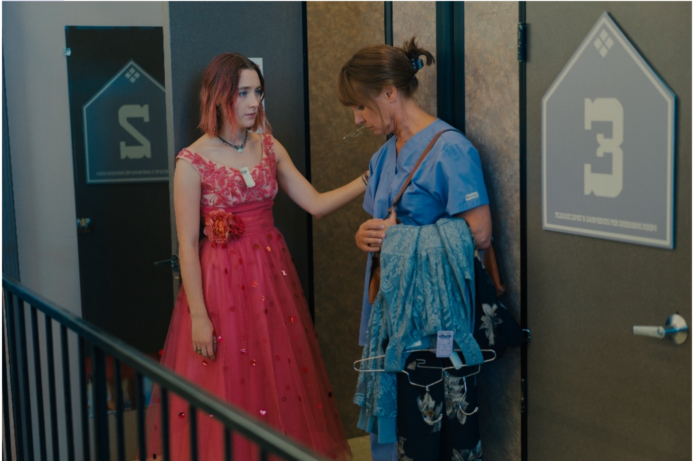
Saoirse Ronan and Laurie Metcalf in "Lady Bird"