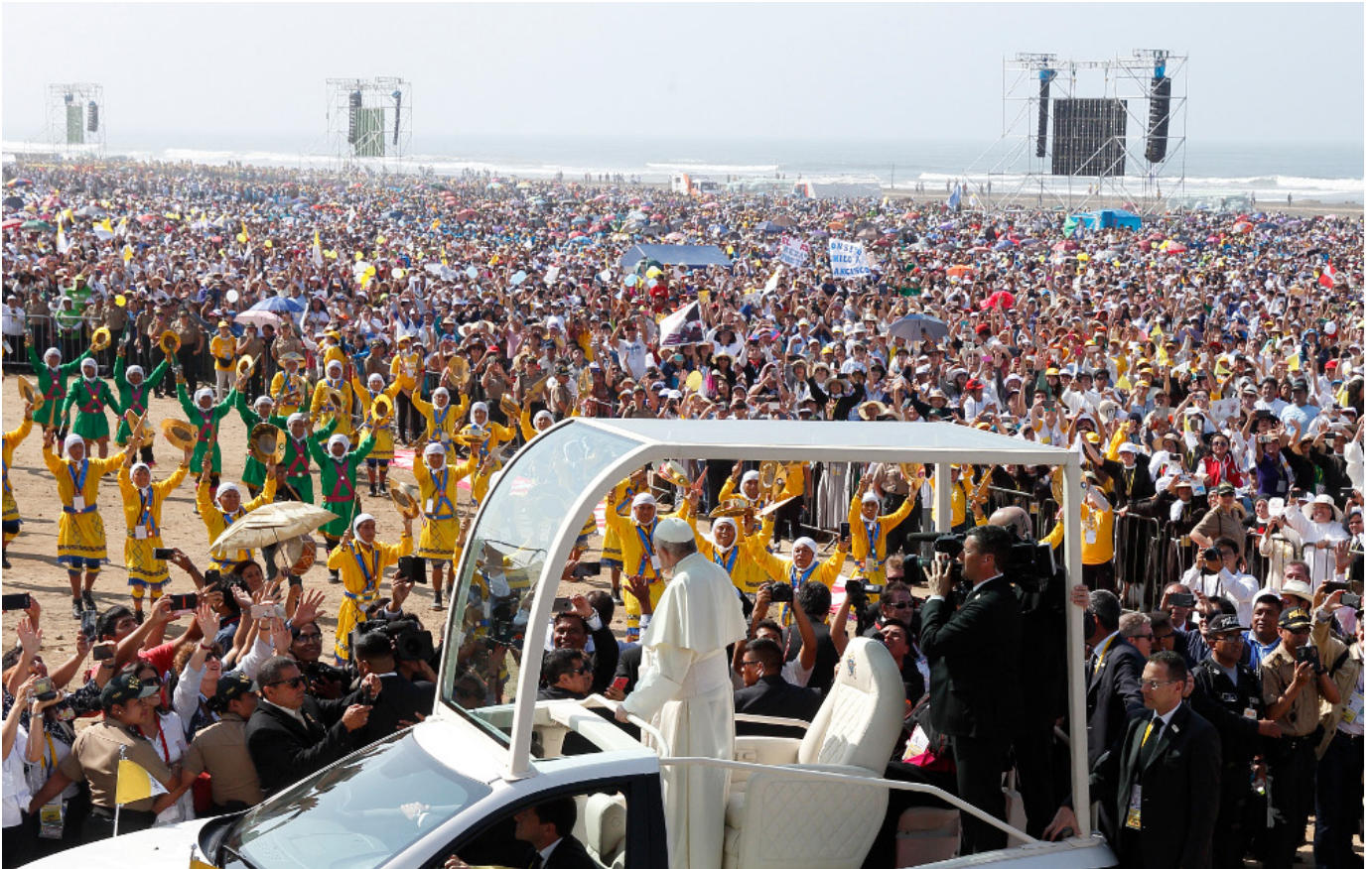
Pope Francis greets the crowd before celebrating Mass at the beach in Huanchaco, Peru, Jan. 20.