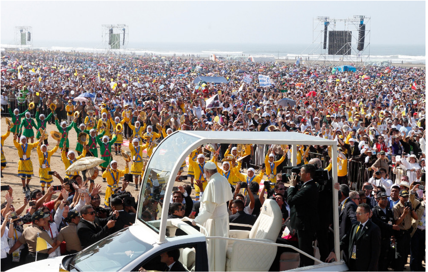
Pope Francis greets the crowd before celebrating Mass at the beach in Huanchaco, Peru, Jan. 20.