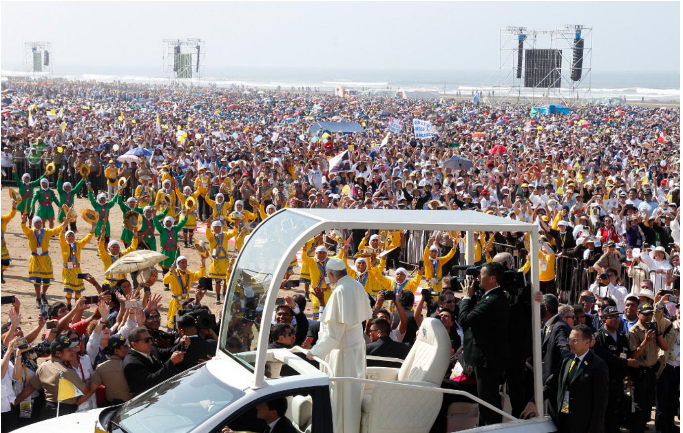
Pope Francis greets the crowd before celebrating Mass at the beach in Huanchaco, Peru, Jan. 20.