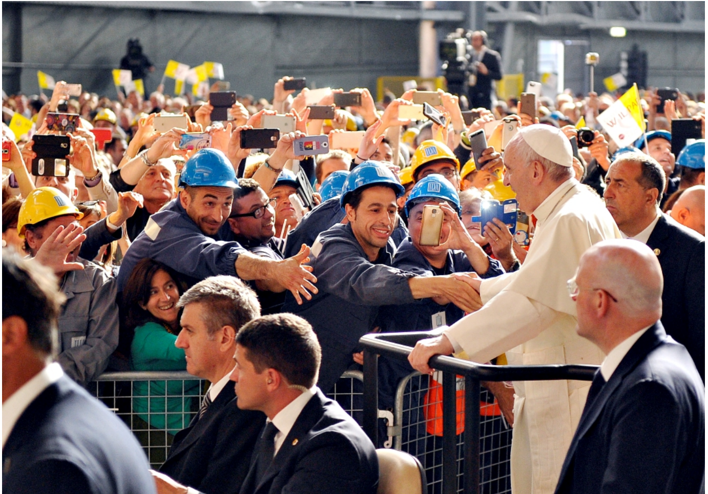
Pope Francis greets workers as he arrives at the ILVA steel plant during a May 2017 pastoral visit in Genoa, Italy.