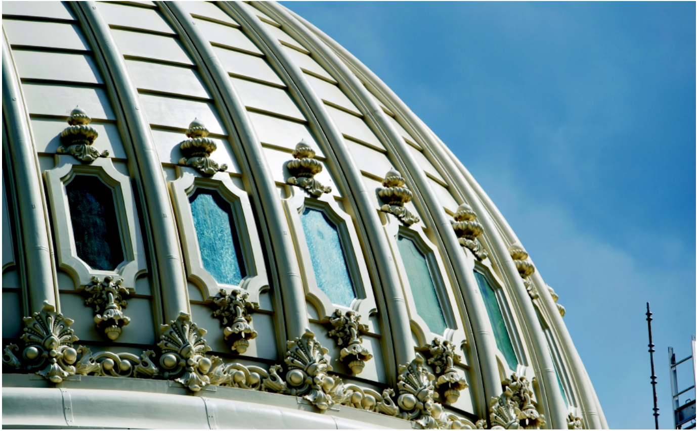
The Capitol dome in Washington, D.C. (Wikimedia Commons/Architect of the Capitol)