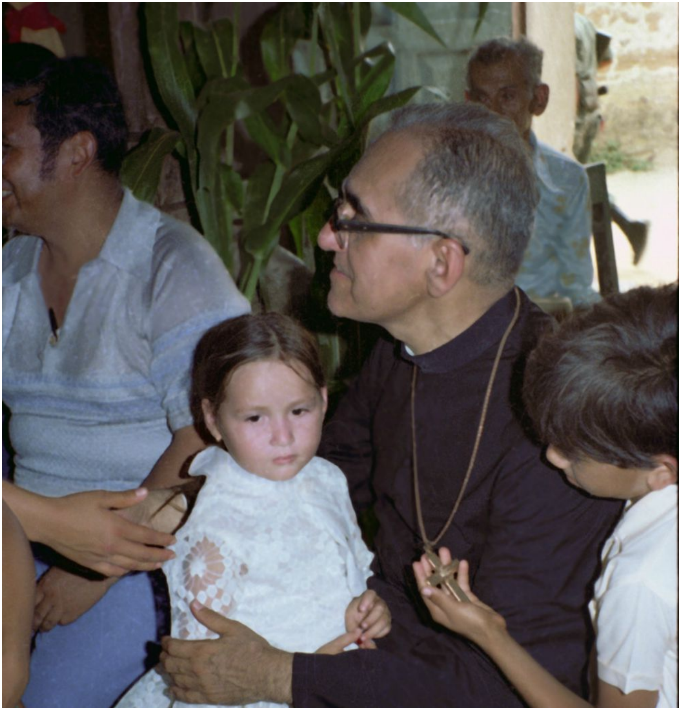
Archbishop Óscar Romero is pictured inside the church at San Antonio Los Ranchos in Chalatenango, El Salvador, in 1979.