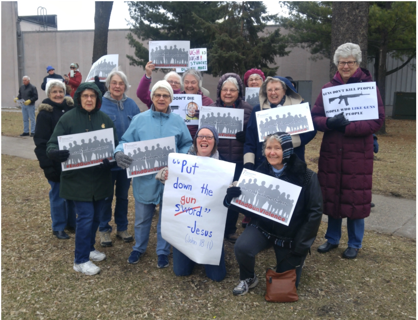
Franciscan Sisters of Perpetual Adoration gather at the downtown March for Our Lives in La Crosse, Wisconsin, while another group of the sisters march in solidarity with the students at St. Rose Convent, the congregational motherhouse across town.