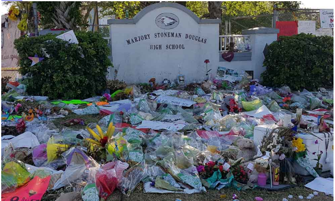
Memorial outside Marjory Stoneman Douglas High School, March 9, in Parkland, Florida