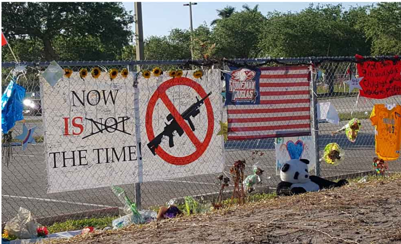
Memorial outside Marjory Stoneman Douglas High School, March 9, in Parkland, Florida