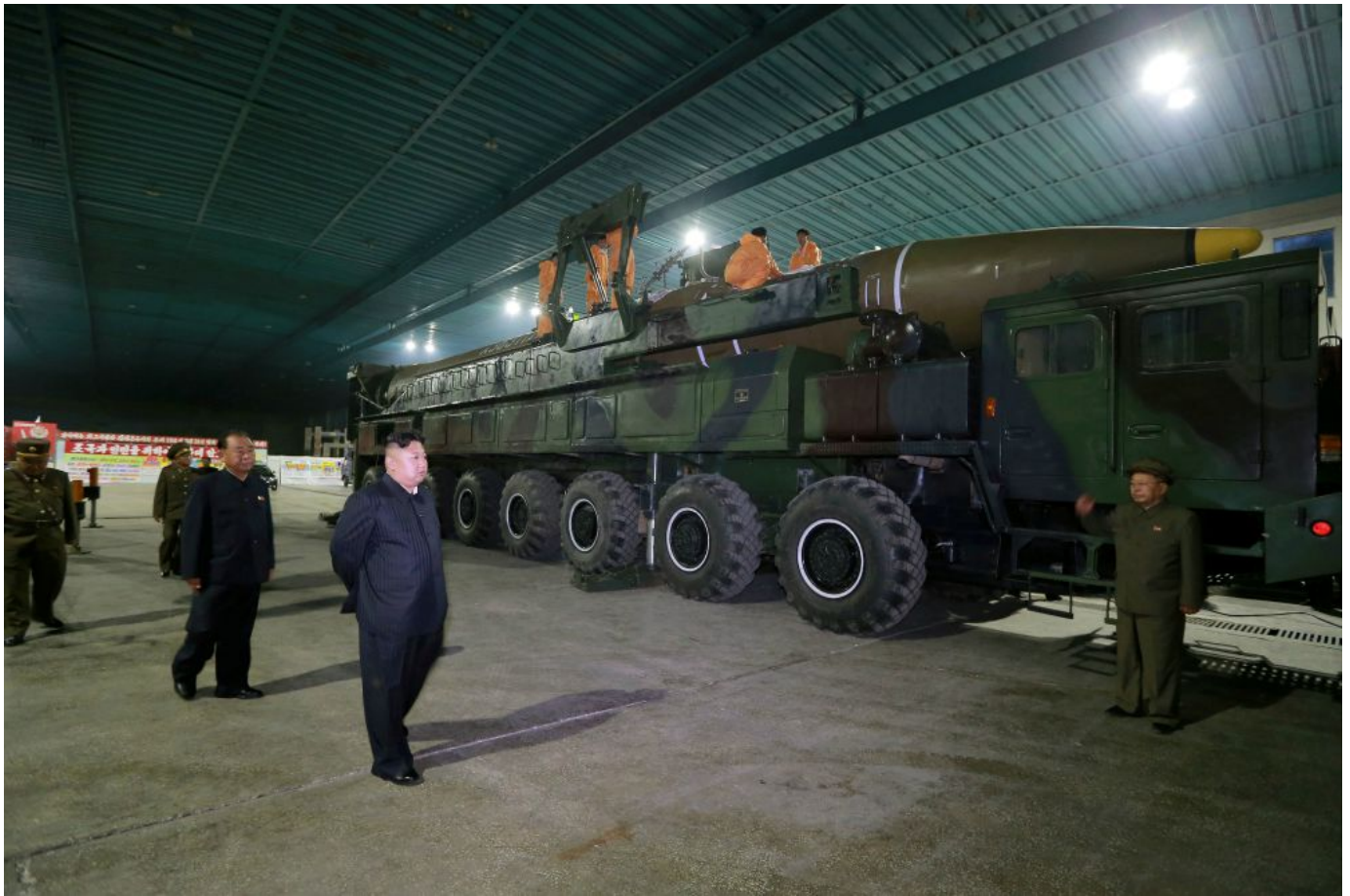
North Korean leader Kim Jong Un inspects the intercontinental ballistic missile Hwasong-14 in this undated photo released by North Korea's Korean Central News Agency. (CNS/Reuters/KCNA)