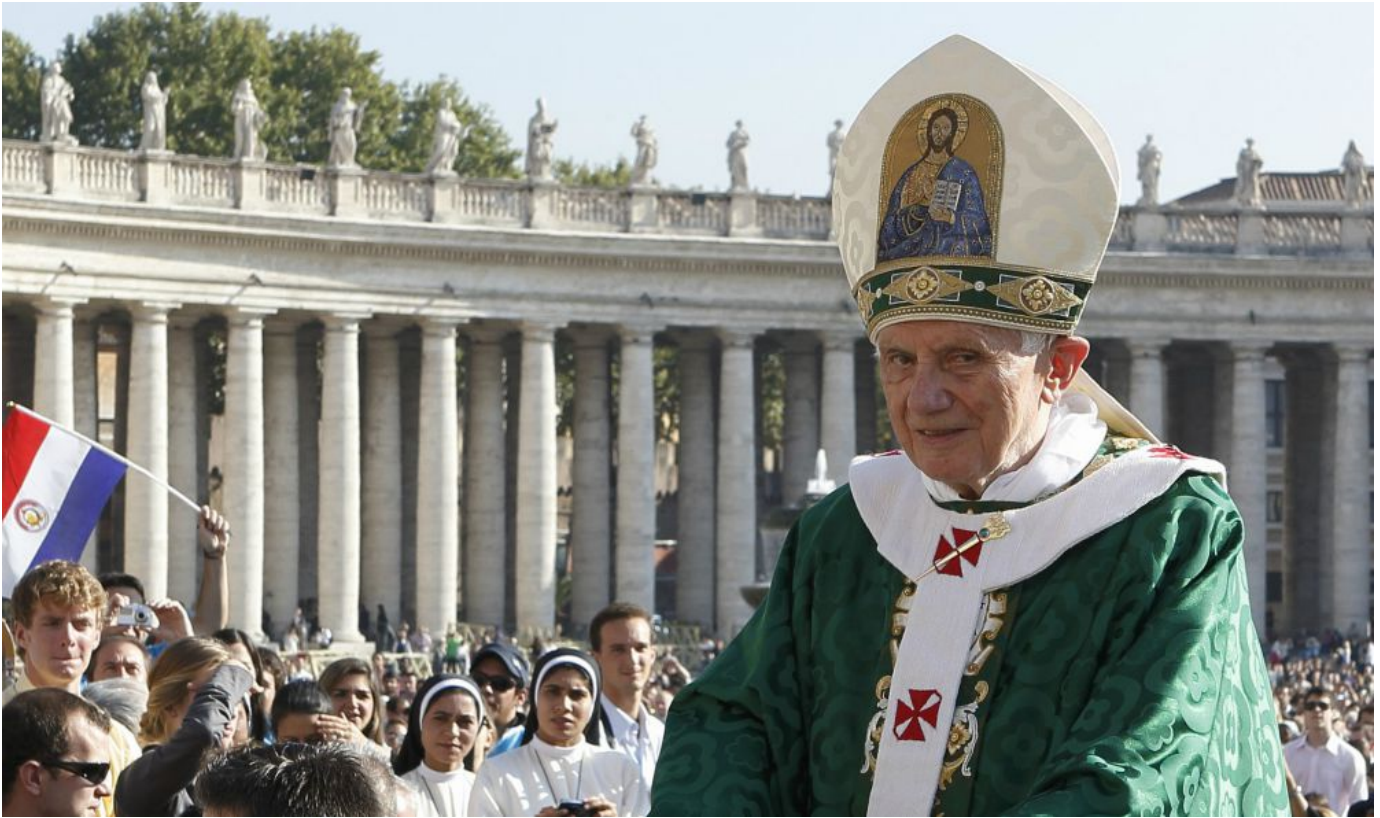
Pope Benedict XVI arrives to celebrate a Mass opening the Year of Faith in St. Peter's Square at the Vatican, Oct. 11, 2012.