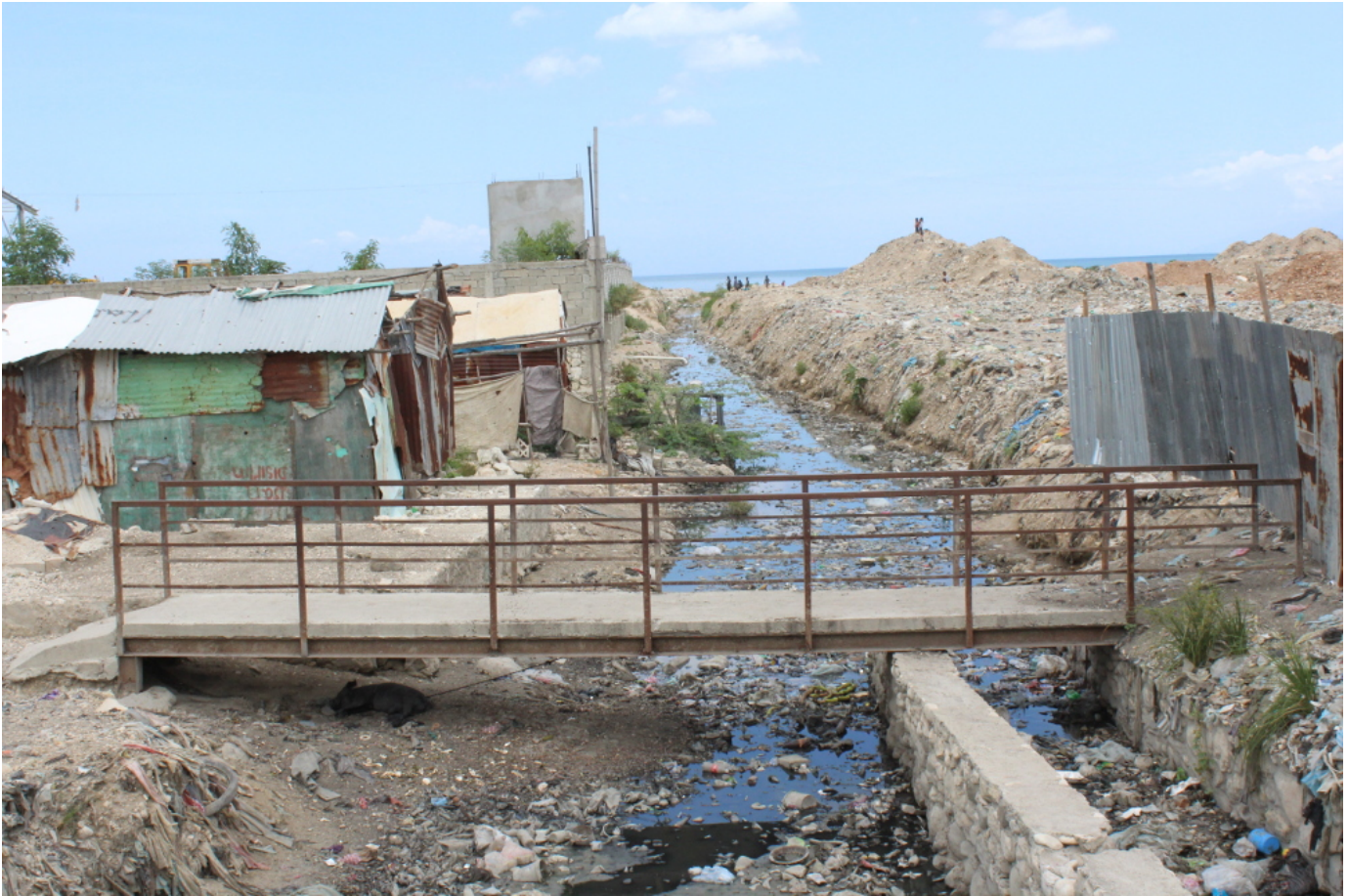
Cap-Haïtien is at Haiti's northern tip.

"We are Haitians. Sometimes we go without food for two days or more."