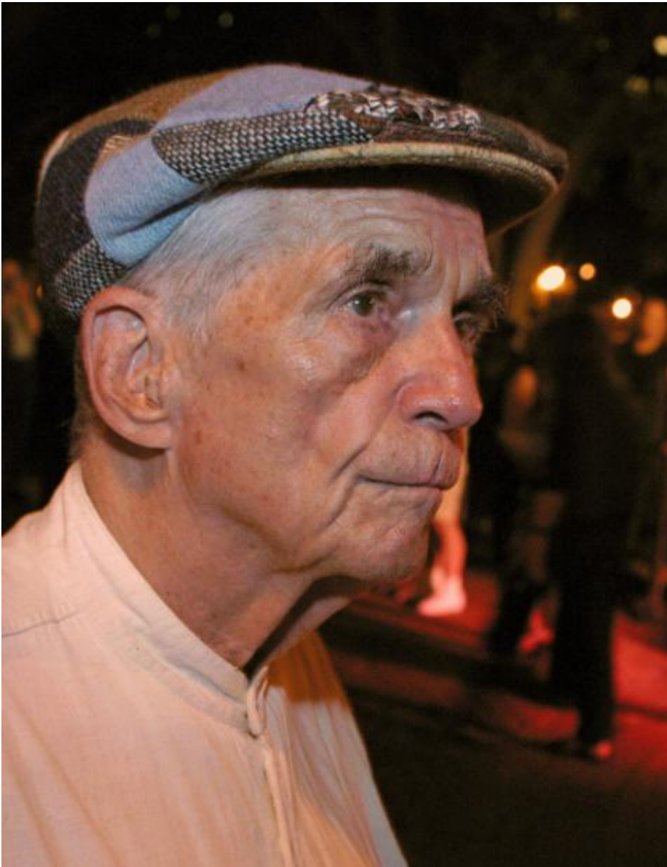
Jesuit Fr. Daniel Berrigan, pictured in a 2002 photo in New York

Declining to exit the public square in order to begin serving his sentence as scheduled, Dan went underground. Sheltering in a Sherwood Forest of friends and friends of friends, Dan led the FBI on a Robin Hood-like chase that lasted four months.