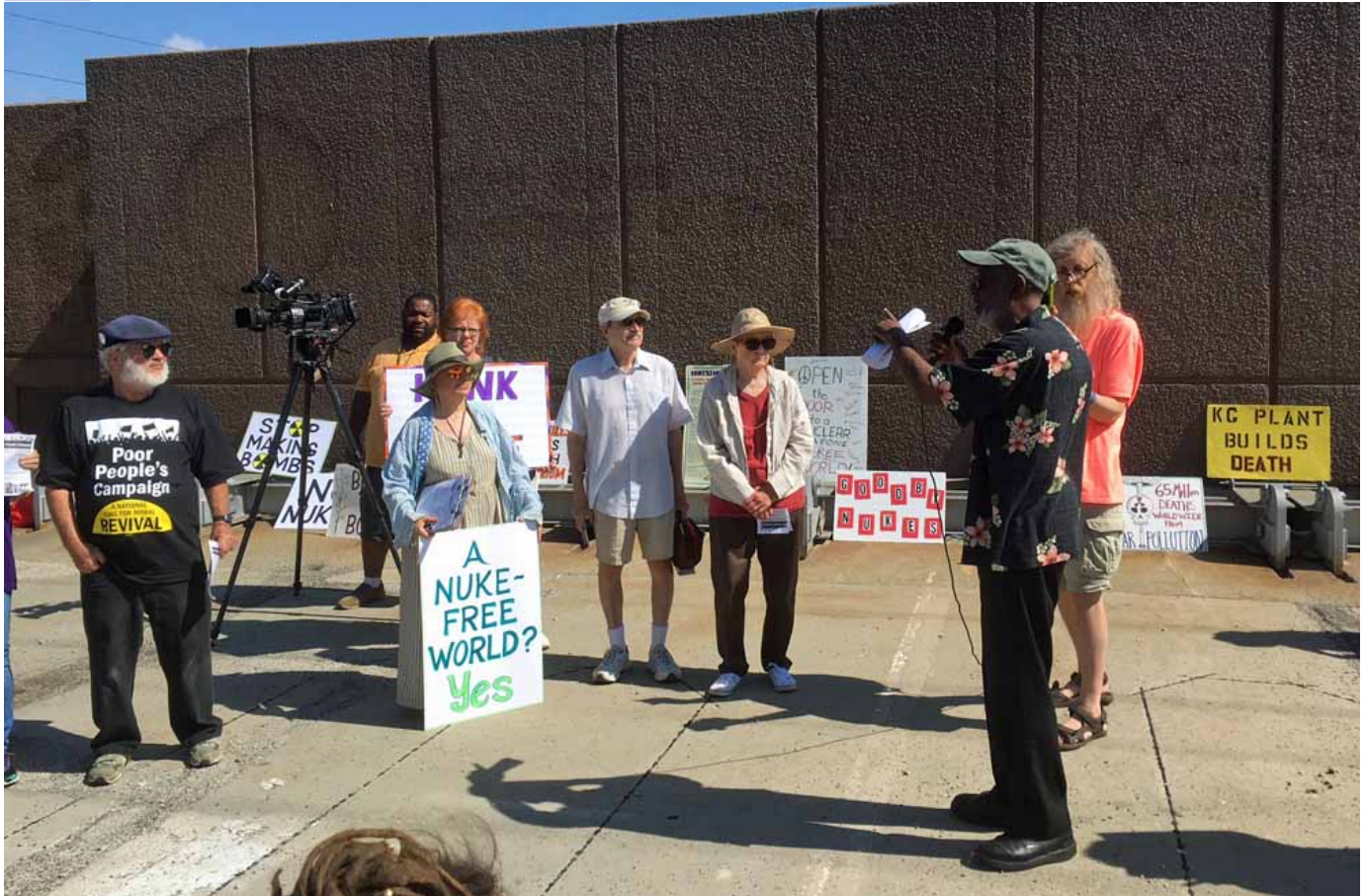
Protesters gather outside of the National Security Campus in Kansas City, Missouri, on Memorial Day, May 28, to oppose nuclear weapons.