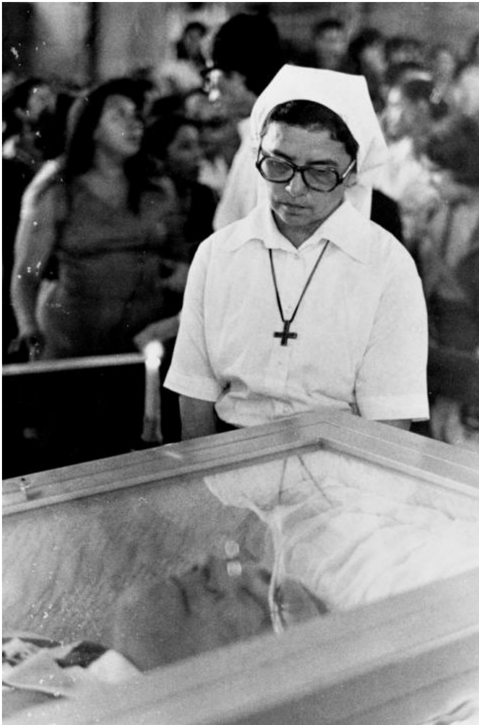
A mourner views Archbishop Óscar Romero's body during his funeral at the Cathedral of San Salvador, El Salvador, on March 30, 1980.

There were many threats against Romero's life. In February 1980, he wrote a letter to U.S. President Jimmy Carter, urging him as a Christian and a supporter of human