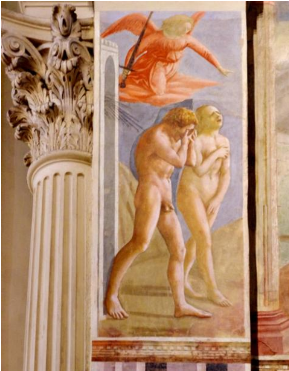
Masaccio's "Expulsion from the Garden of Eden" (circa 1425)