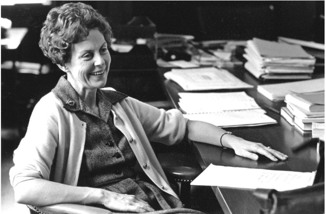
Jill Ker Conway