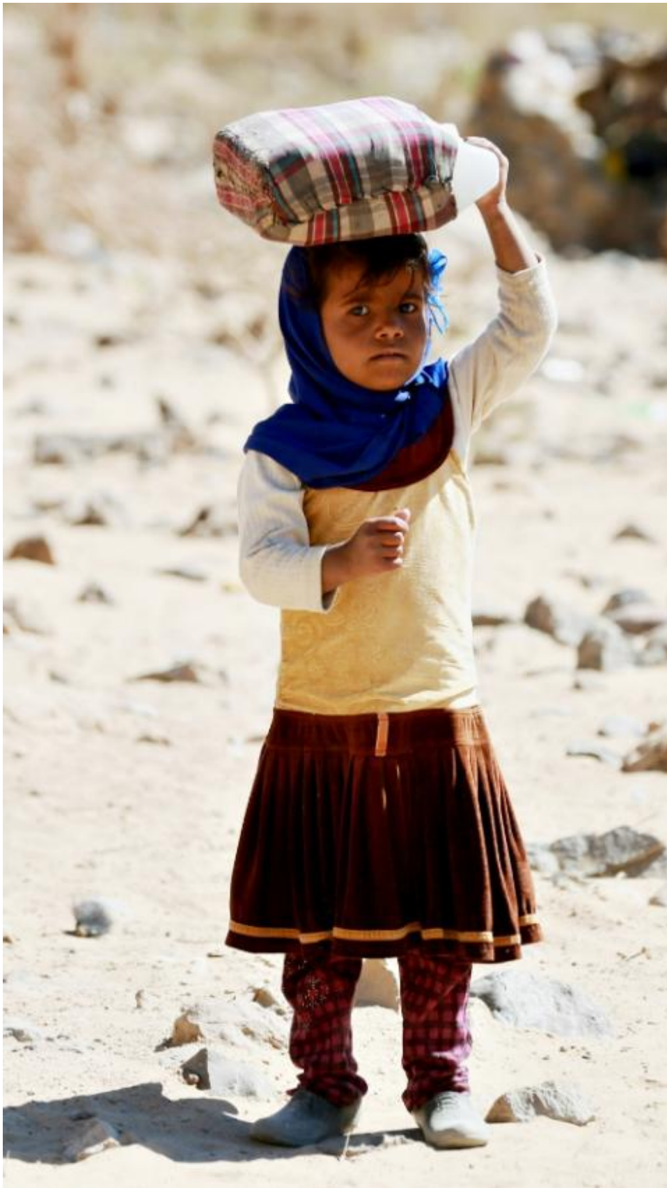
A displaced Yemeni girl carries a water container March 29 at a refugee camp located between Marib and Sanaa, Yemen.