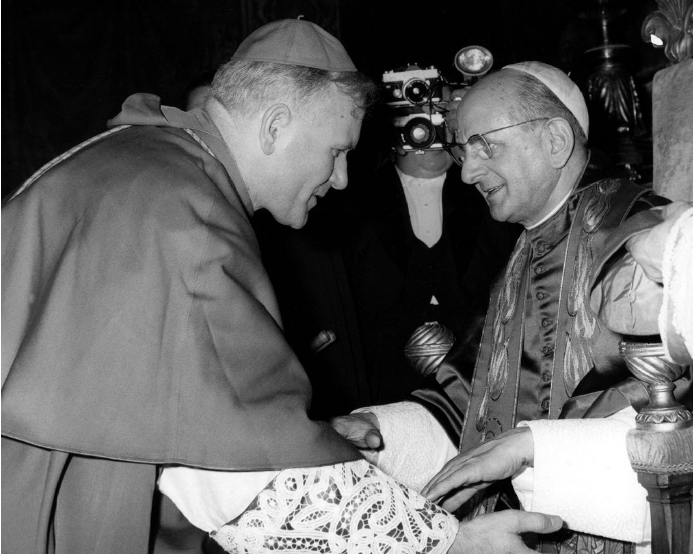
Cardinal Karol Wojtyla, who later became Pope John Paul II, is congratulated by Pope Paul VI at his installation as cardinal in the Sistine Chapel June 26, 1967.