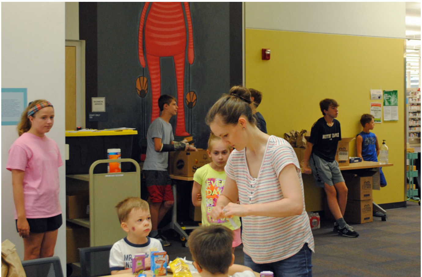
Families, assisted by volunteers, participate in a free lunch program sponsored by Catholic Charities of Northeast Kansas at the Johnson County Central Resource