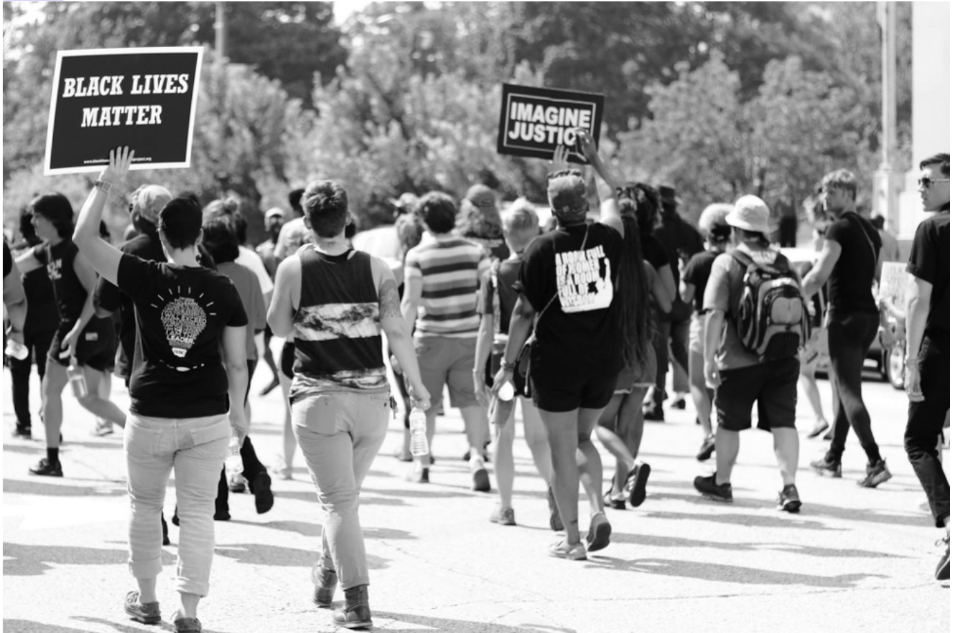
Participants at a 2017 Black Lives Matter demonstration in St. Louis. (Kristen Trudo)