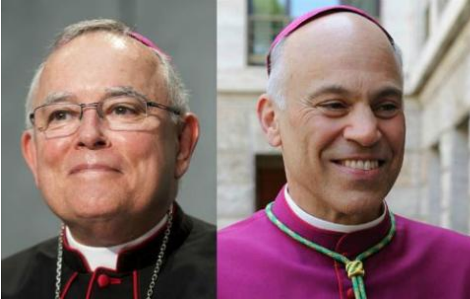
Archbishop Charles Chaput of Philadelphia, pictured 2014, left, and Archbishop Salvatore Cordileone of San Francisco, pictured 2013

pathways and different directions, has not all this created an EWTN bubble in which it is acceptable for a bishop to affirm his loyalty to an ex-nuncio and not to the pope himself? Again, I refer you to the actual headline at the Register when the Viganò story broke: " Ex-Nuncio Accuses Pope Francis of Failing to Act on McCarrick's Abuse ." Except Pope Francis is the one who demonstrably acted against McCarrick. There will be no video of Francis, on the day of his retirement, greeting McCarrick with a warm smile as Benedict did.