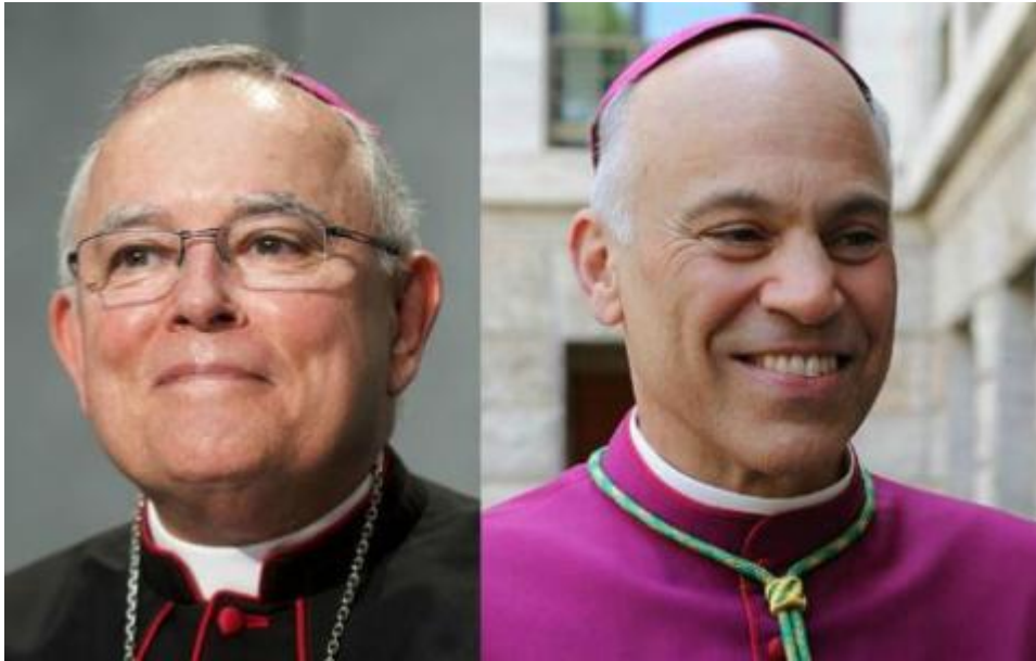
Archbishop Charles Chaput of Philadelphia, pictured 2014, left, and Archbishop Salvatore Cordileone of San Francisco, pictured 2013

pathways and different directions, has not all this created an EWTN bubble in which it is acceptable for a bishop to affirm his loyalty to an ex-nuncio and not to the pope himself? Again, I refer you to the actual headline at the Register when the Viganò story broke: " Ex-Nuncio Accuses Pope Francis of Failing to Act on McCarrick's Abuse ." Except Pope Francis is the one who demonstrably acted against McCarrick. There will be no video of Francis, on the day of his retirement, greeting McCarrick with a warm smile as Benedict did.