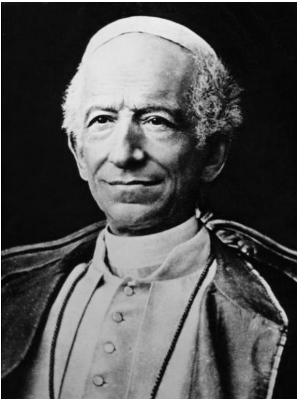
Pope Leo XIII, b. Italy March 2, 1810, pictured in an undated photo

Bishops Joseph Strickland, Robert Morlino and Thomas Olmsted, and Archbishops Charles Chaput and Salvatore Cordileone all managed to mouth praise for the nuncio and his integrity and honesty, without a word of consideration for Pope Francis.