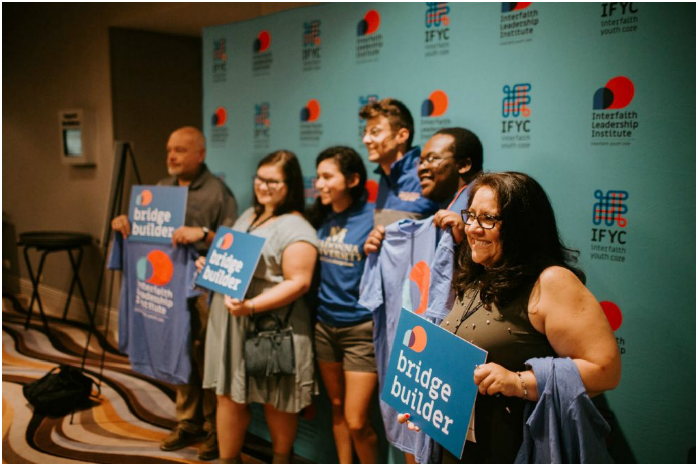
A campus delegation gathers for a photograph during registration the 2018 Interfaith Leadership Institute.