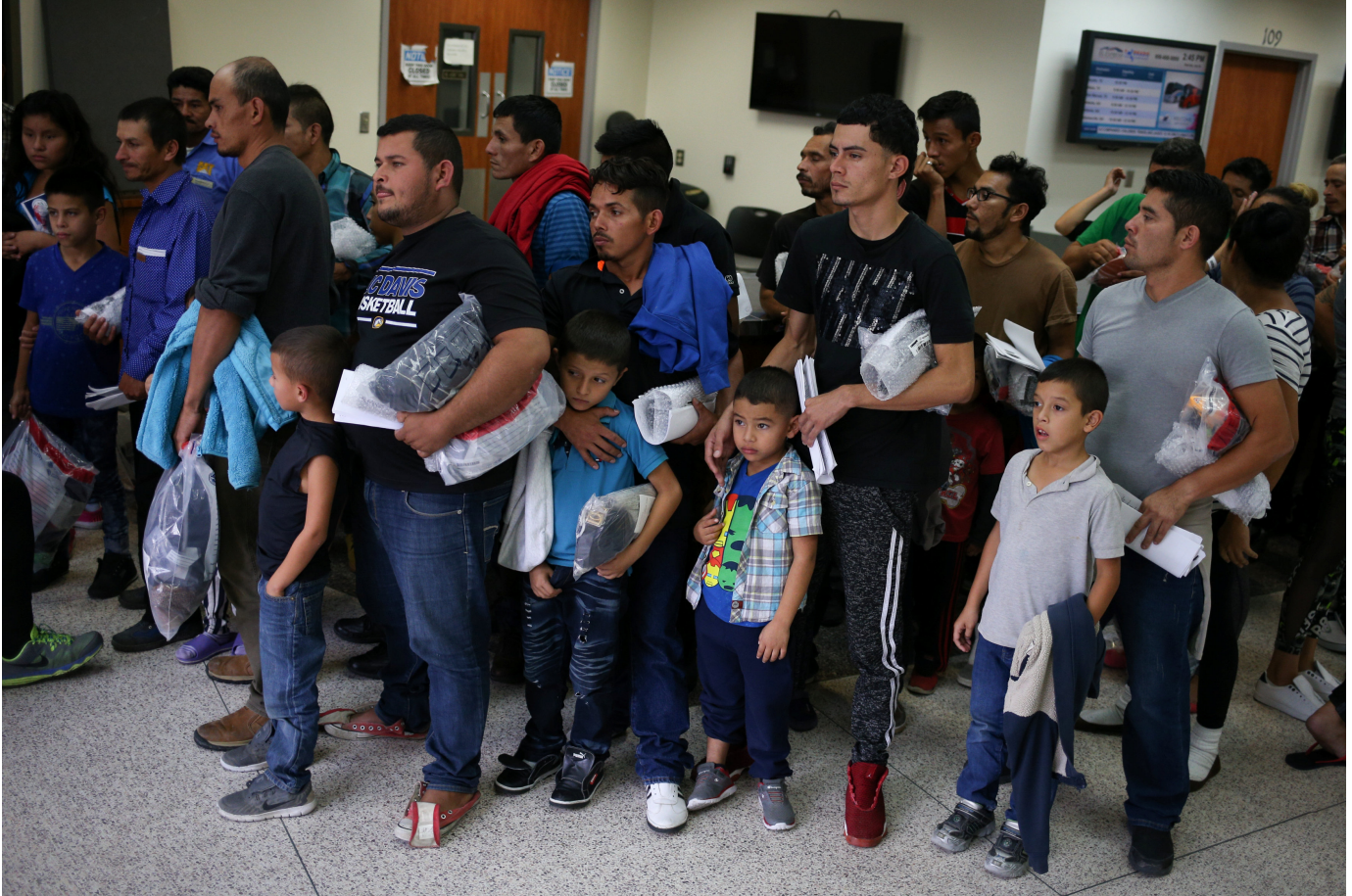
Immigrant families are released from detention July 27 at a bus depot in McAllen, Texas.