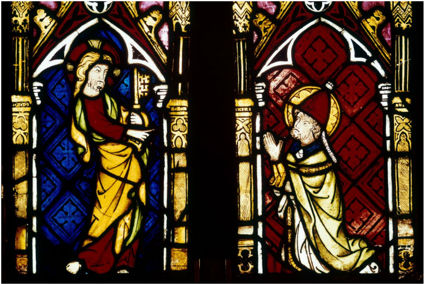
"Christ Presenting the Keys to Saint Peter," circa 1315-20, Cologne, Germany

At the time of Christ's death, there was no business plan. No agreement on who should do what, and an incipient mood suggesting that maybe the entire enterprise wasn't going anywhere. Still holding to a business analogy, the 12 men, who were inspired after Jesus' murder and resurrection, were fired with the belief they had a message the world needed even if, at that moment, the world didn't know it wanted it.