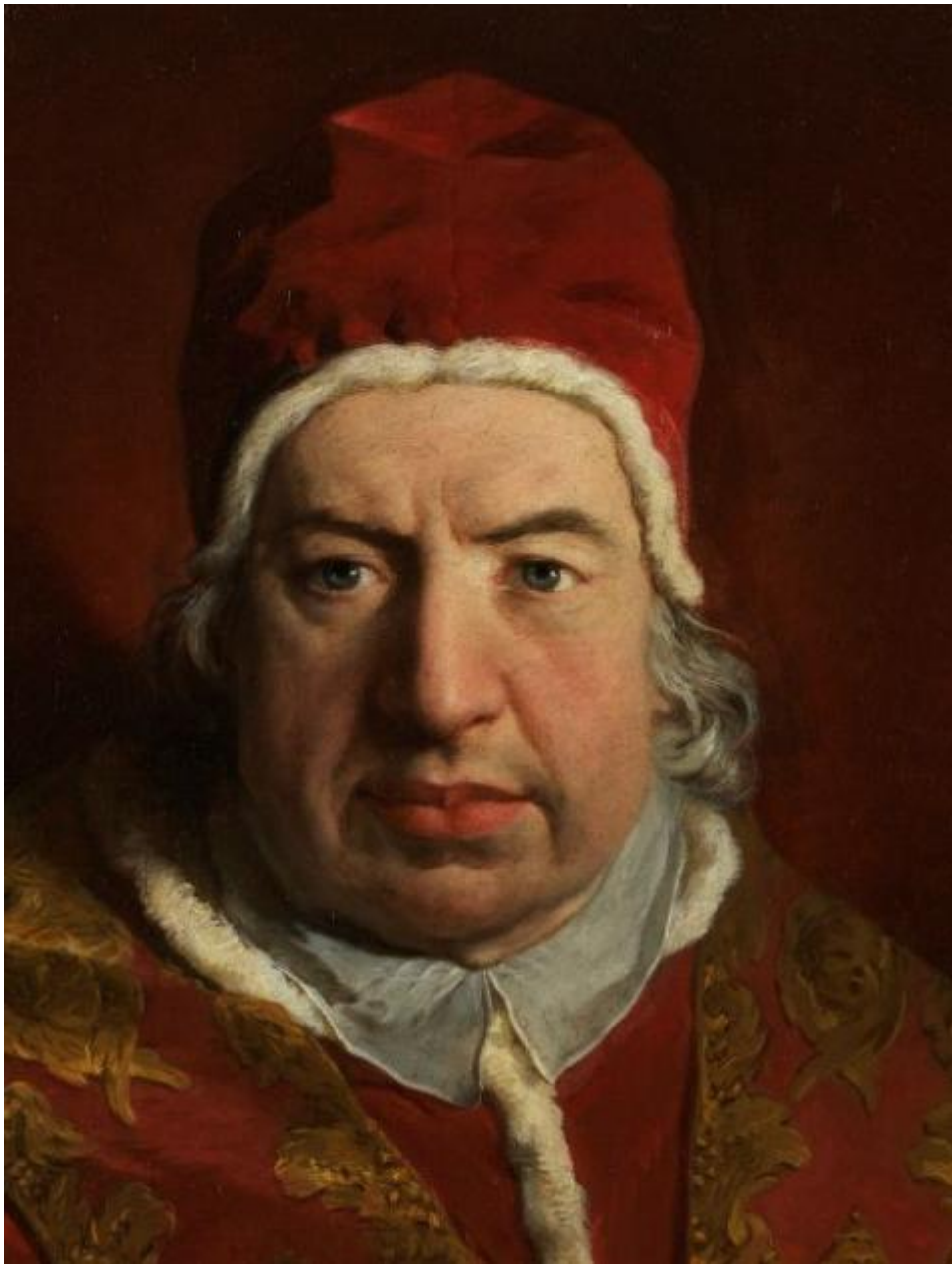
Detail of "Pope Benedict XIV" by Pierre Hubert Subleyras, 1746 (Metropolitan Museum of Art)

Emperor Constantine was Christianity's first celebrity product endorser. This new religion, Christianity, was a challenge and an opportunity. At one level he orchestrated a non-hostile takeover of the mystique and its utility to his structure, but Constantine had little interest in handling the Mystery packet itself (though he did later convert to Christianity and call a council). Constantine's takeover worked — at least to Constantine's satisfaction.