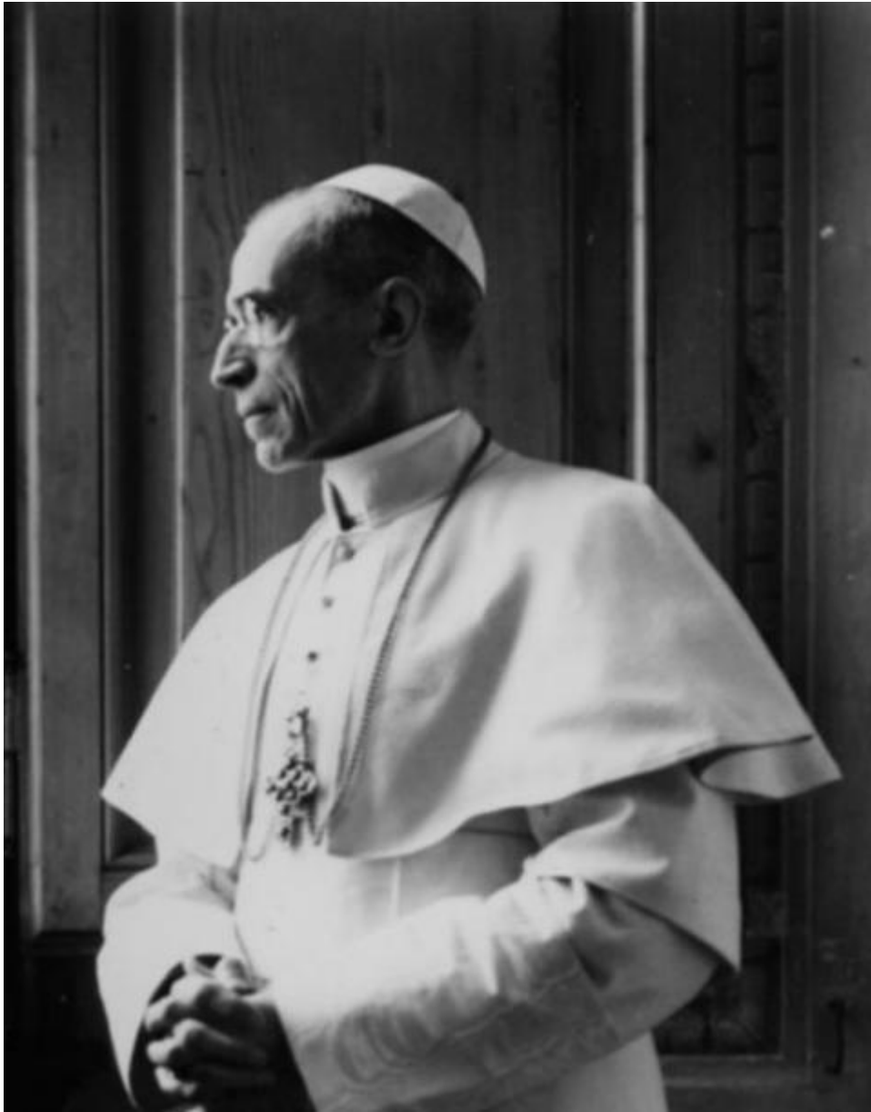
Pope Pius XII is pictured at the Vatican in a file photo dated March 15, 1949.

The Church-in-Rome's managerial closed shop, limited to selected male clerics, was at the root of the pedophilia crisis. Not for what it permitted, but for what the Church-in-Rome (pope, College of Cardinals, Curia and senior archbishops and bishops), i.e., the church bureaucracy, fostered: an exclusive Old Boys Club based on a rigid class system.