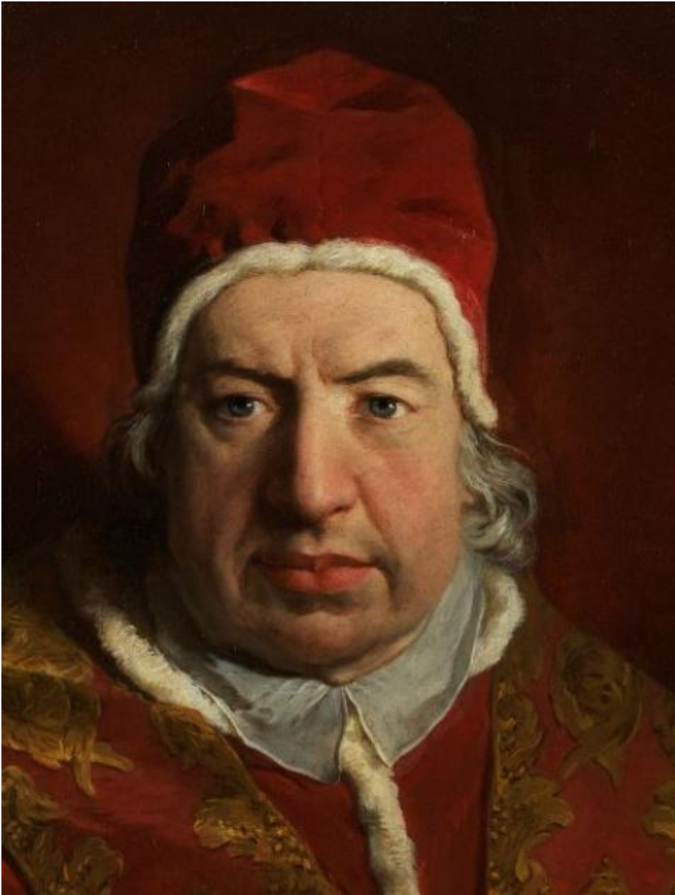
Detail of "Pope Benedict XIV" by Pierre Hubert Subleyras, 1746 (Metropolitan Museum of Art)

Emperor Constantine was Christianity's first celebrity product endorser. This new religion, Christianity, was a challenge and an opportunity. At one level he orchestrated a non-hostile takeover of the mystique and its utility to his structure, but Constantine had little interest in handling the Mystery packet itself (though he did later convert to Christianity and call a council). Constantine's takeover worked — at least to Constantine's satisfaction.