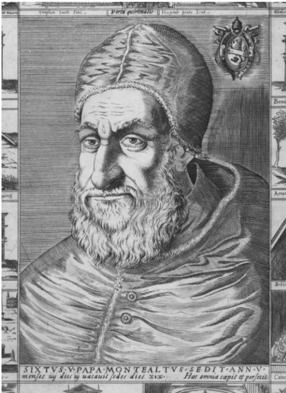
Detail of engraving, "Portrait of Sixtus V," published by Nicolaus van Aelst, circa 1589 (Metropolitan Museum of Art)

Leo the Great (440-461): Leo established the monarchy and used the royal "we" borrowed later by Queen Victoria. He ruled Italy and defeated barbarians. His letter, "Leo's Tome," written to the Council of Chalcedon in 451, led others to believe that "Peter has spoken through Leo." Leo claimed succession to Peter.