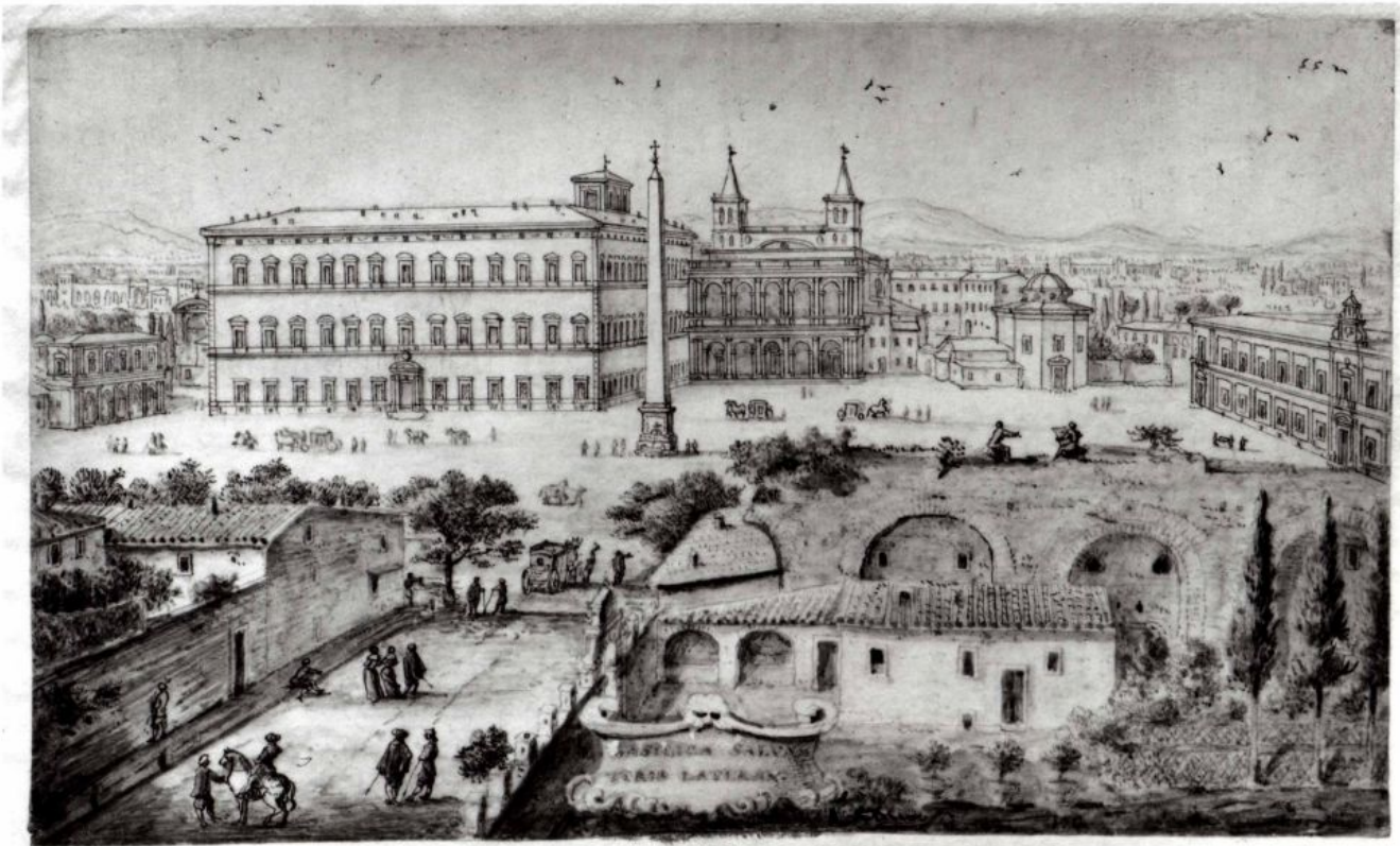
"View of Lateran, Rome," by Lievin Cruyl, 1672-73

Christianity used the internet of the day — word-of-mouth. For much of the time in the early decades, and in many places, no one but other Christians quite knew for sure who was Christian and who was not.