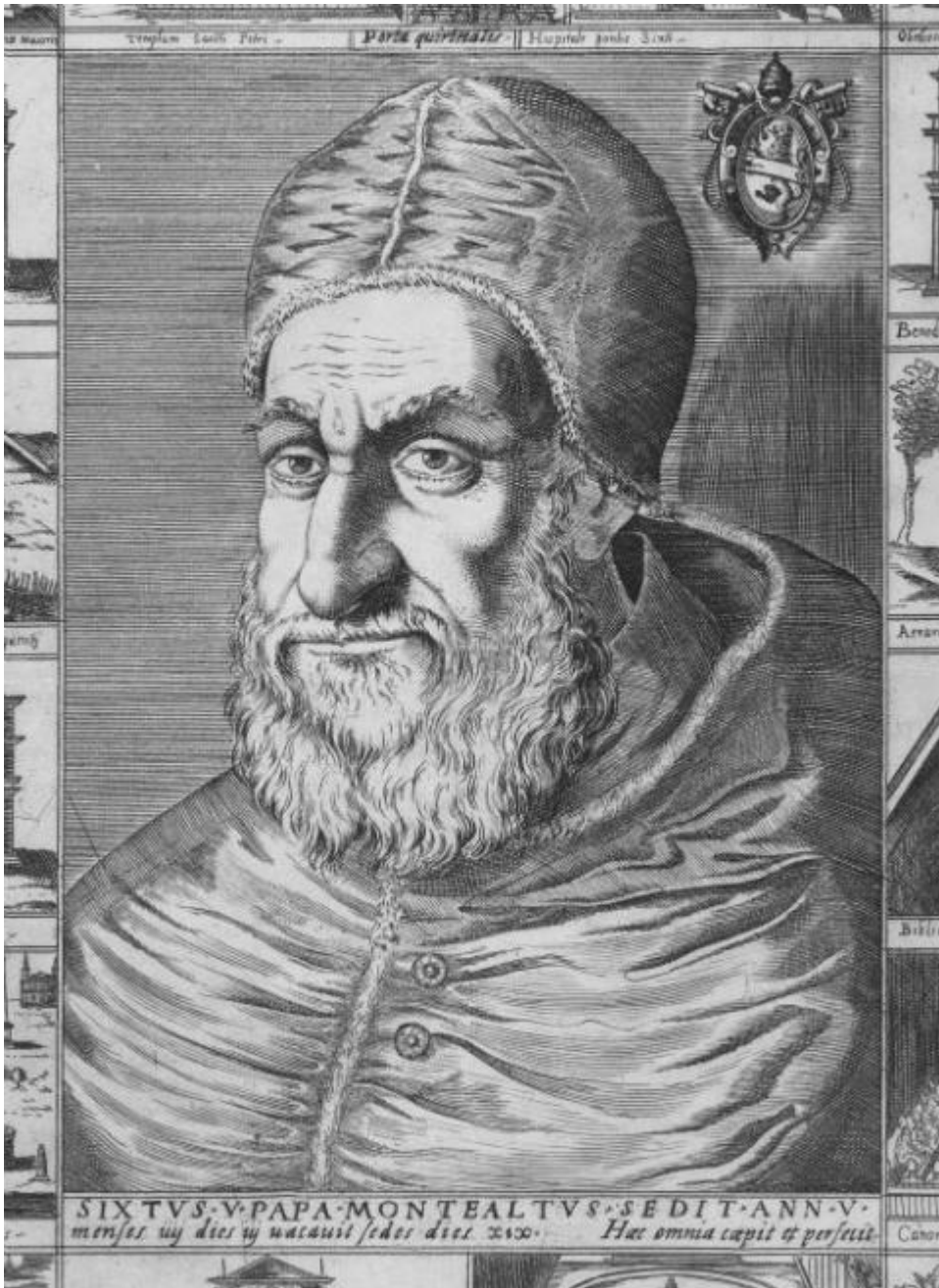
Detail of engraving, "Portrait of Sixtus V," published by Nicolaus van Aelst, circa 1589

Leo the Great (440-461): Leo established the monarchy and used the royal "we" borrowed later by Queen Victoria. He ruled Italy and defeated barbarians. His letter, "Leo's Tome," written to the Council of Chalcedon in 451, led others to believe that "Peter has spoken through Leo." Leo claimed succession to Peter.