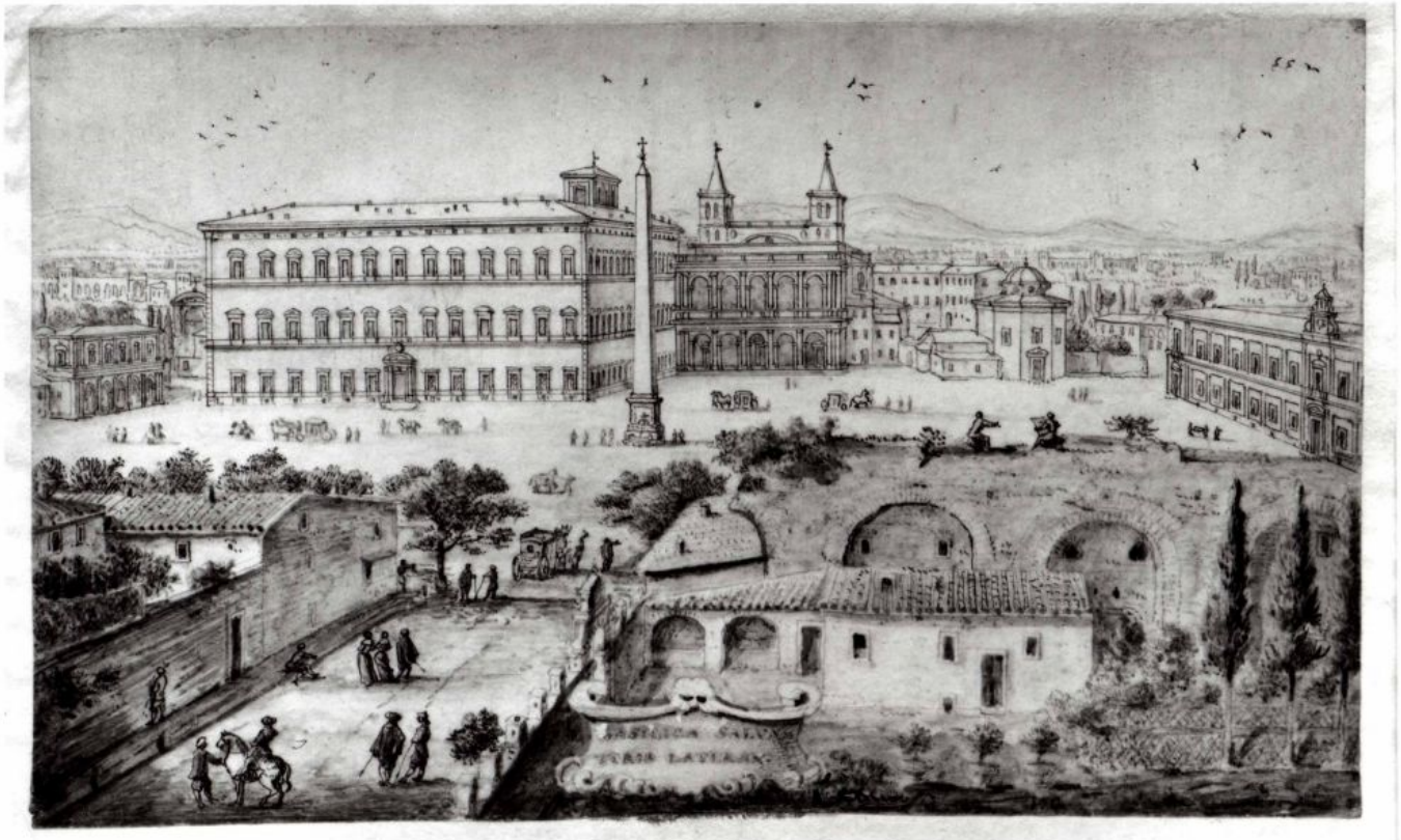
"View of Lateran, Rome," by Lievin Cruyl, 1672-73

Christianity used the internet of the day — word-of-mouth. For much of the time in the early decades, and in many places, no one but other Christians quite knew for sure who was Christian and who was not.