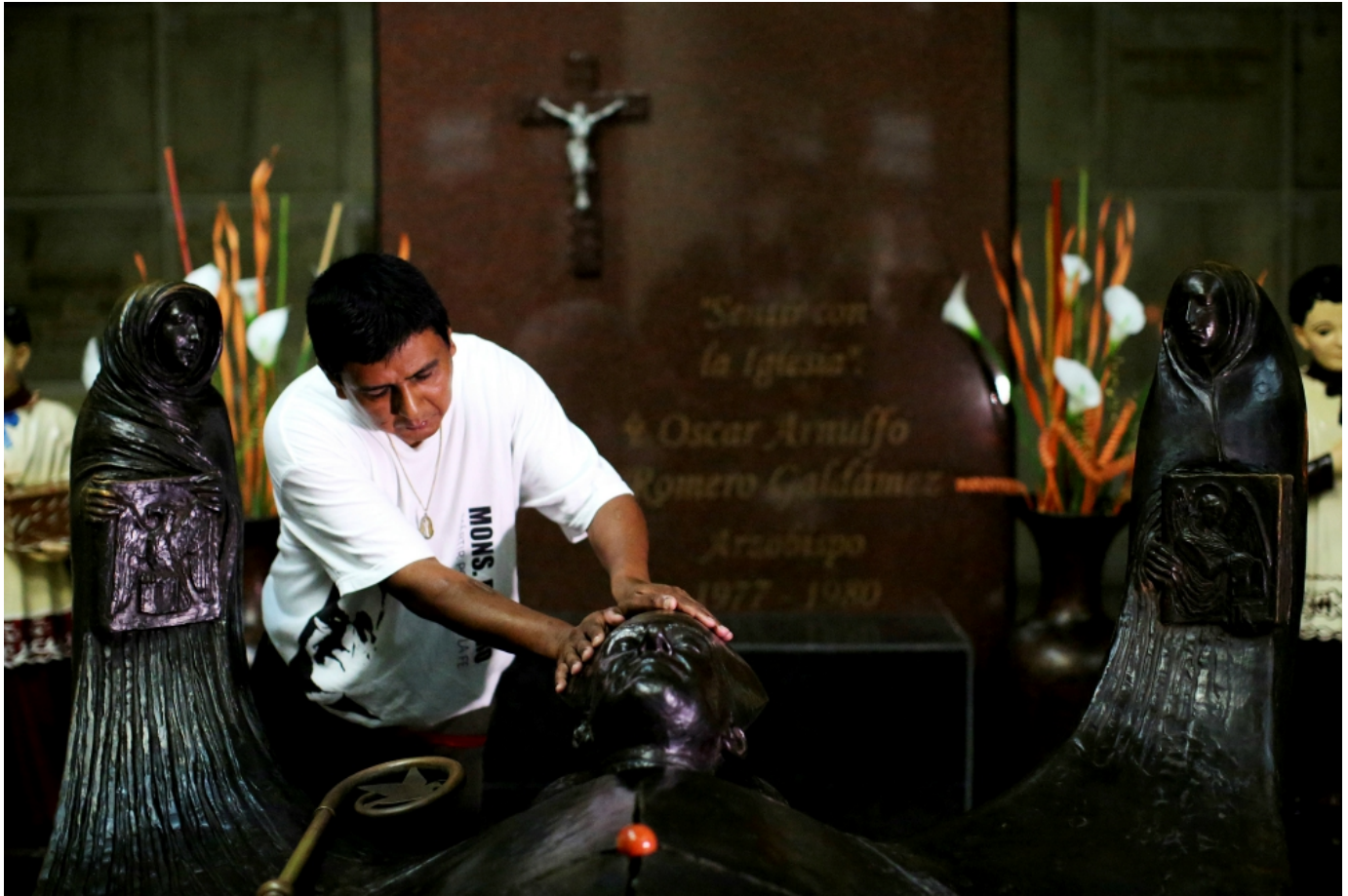
A man prays at the grave of Blessed Oscar Romero in 2017 at the Metropolitan Cathedral in San Salvador, El Salvador.