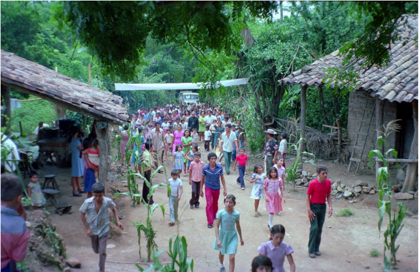
A crowd of people from San Antonio Los Ranchos in Chalatenango, El Salvador, walk with Archbishop Óscar Romero as he arrives to celebrate Mass in 1979.

I came from. I started creating another world. When I went back to El Salvador, they made me the bishop's secretary in San Miguel. I was a parish priest there for 23 years, but I was still buried in paperwork ... Then they sent me to Santiago de María, and I ran into extreme poverty again. Those children that were dying just because of the water they were drinking, those campesinos killing themselves in the harvests ... You know, Father, when a piece of charcoal has already been lit once, you don't have to blow on it much to get it to flame up again ... So yes, I changed. But I also came back home again."