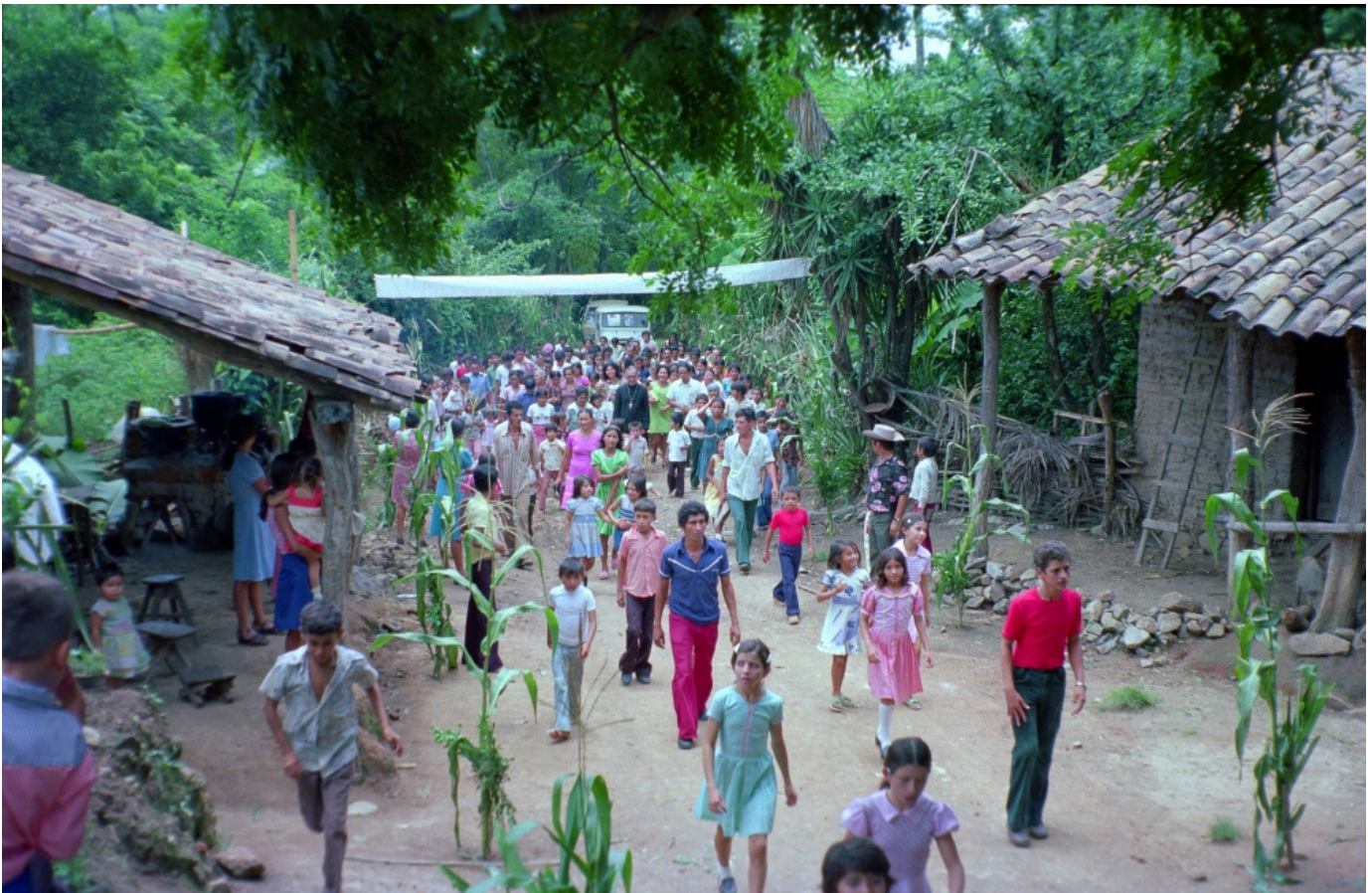
A crowd of people from San Antonio Los Ranchos in Chalatenango, El Salvador, walk with Archbishop Óscar Romero as he arrives to celebrate Mass in 1979.

I came from. I started creating another world. When I went back to El Salvador, they made me the bishop's secretary in San Miguel. I was a parish priest there for 23 years, but I was still buried in paperwork ... Then they sent me to Santiago de María, and I ran into extreme poverty again. Those children that were dying just because of the water they were drinking, those campesinos killing themselves in the harvests ... You know, Father, when a piece of charcoal has already been lit once, you don't have to blow on it much to get it to flame up again ... So yes, I changed. But I also came back home again."