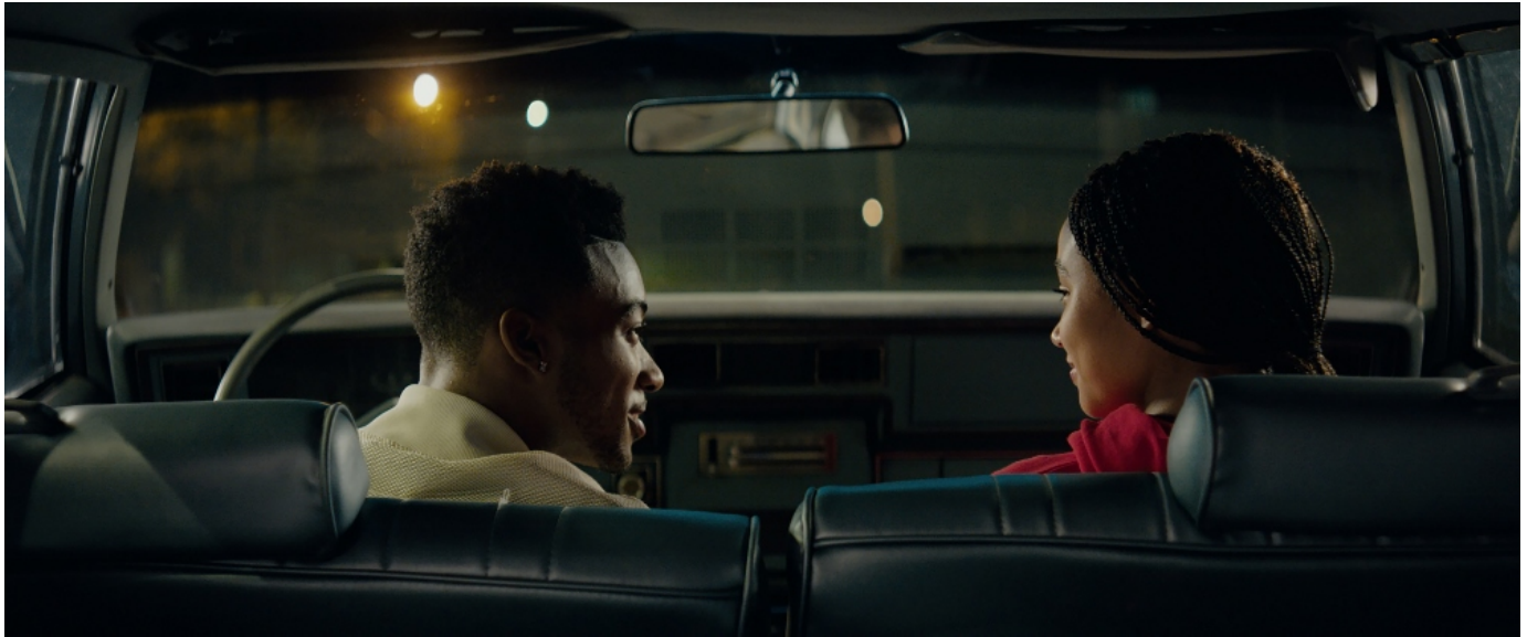
Algee Smith and Amandla Stenberg in "The Hate U Give"

The story makes national news. Not only is another unarmed black male shot by a white policeman, but the media makes it seem that Khalil probably deserved it because he was known to sell drugs, even though no drugs were found on his person or in the car. He also had a known affiliation to a local gang led by King (Anthony Mackie).