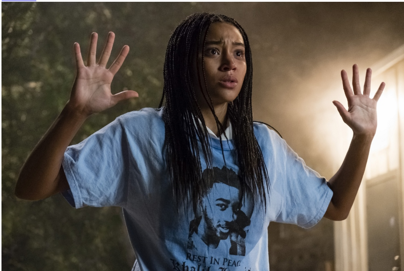
Amandla Stenberg as Starr Carter in "The Hate U Give"