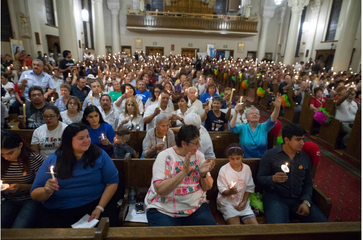
Worshippers attend a candlelight vigil July 20 at St. Patrick's Cathedral in El Paso, Texas, following an immigration march and rally.