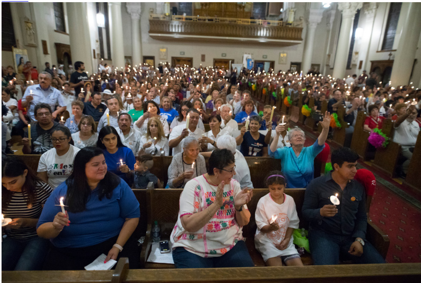
Worshippers attend a candlelight vigil July 20 at St. Patrick's Cathedral in El Paso, Texas, following an immigration march and rally.