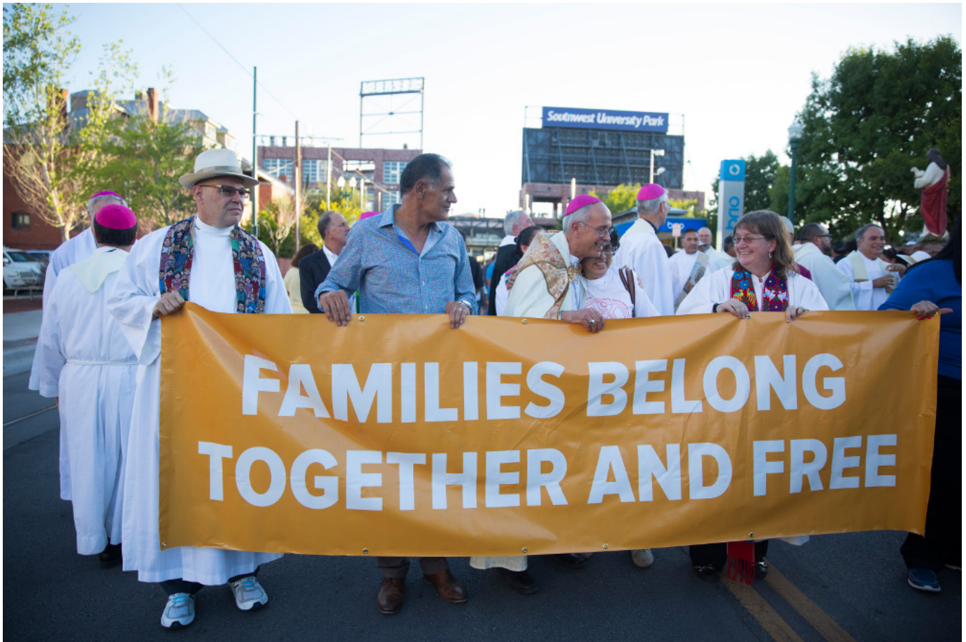
Bishop Mark Seitz of El Paso, Texas, embraces a woman during a march for immigration rights July 20 in El Paso.

Many Hispanics may actually be "more in tune with the Republican Party" in many ways but are currently alienated by harsh anti-immigrant rhetoric, he added. "If the Republican Party were to ever develop a strong immigration position I think the Democrats would find themselves incredibly threatened trying to keep the Hispanic vote."