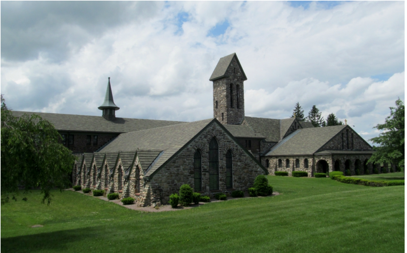
St. Joseph's Abbey in Spencer, Massachusetts