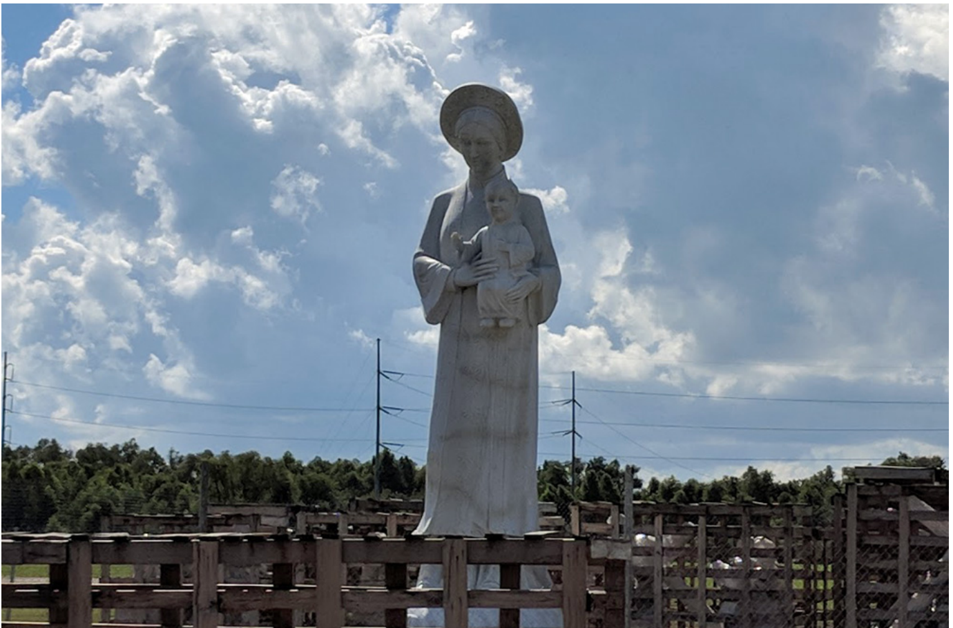
The statue of Our Lady of La Vang in New Orleans

The statue was carved from one piece of solid marble in Vietnam and then shipped to New Orleans this summer, he said, adding that the statue will be placed on an 11-foot foundation. A park will be developed around the statue in the coming year.