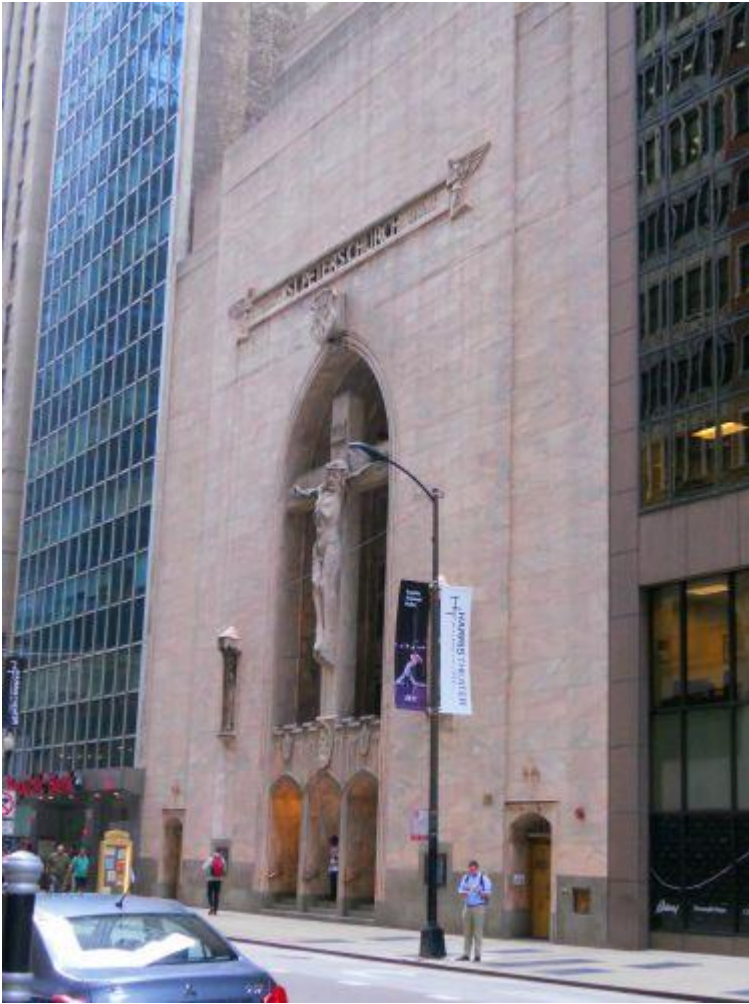
St. Peter's Franciscan Church in the Loop.